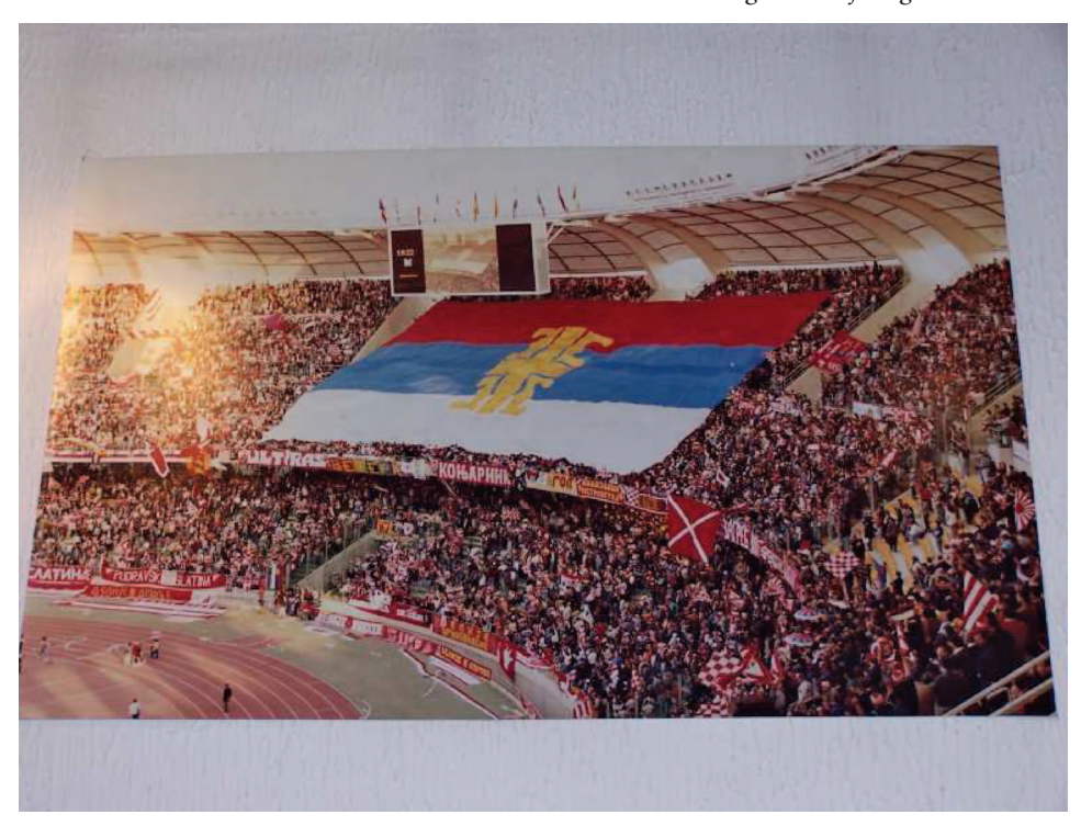
Figure 5 A photo of the giant Serbian flag in the Red Star Museum