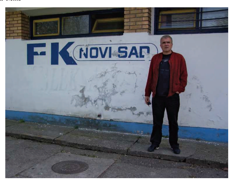
Figure 7 The FK Novi Sad director is concerned about his club's crumbling infrastructure

clubs from owning assets – a negative hangover from the former Communist regime – although attempts to rectify this situation have been on going for a number of years. As a consequence of these antiquated laws, which still remain unaltered at the time of writing, clubs have found it virtually impossible to attract outside investment.