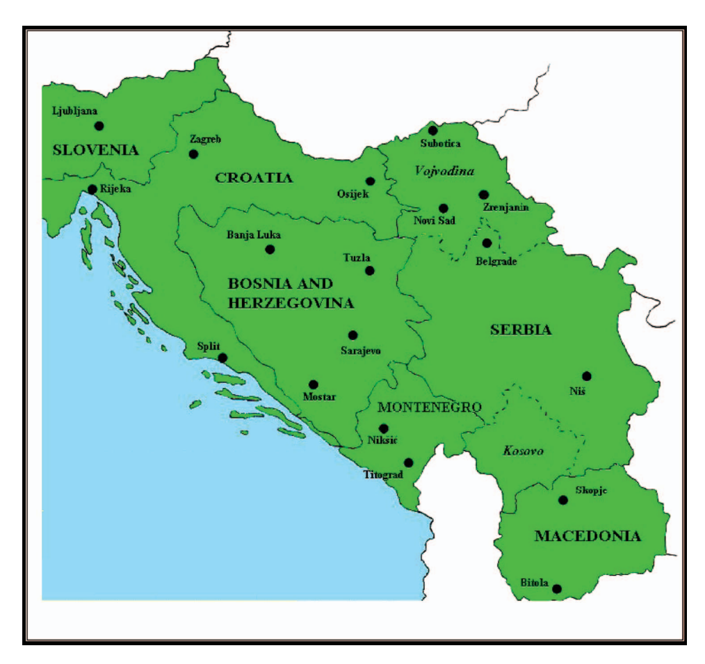
Figure 3 Yugoslavia-Cities with Football Clubs that participated in the First Federal League during the 1990–91 or 1991–92 Seasons

Note : The pre-conflict republican boundaries shown here, along with the Kosovan provincial boundary, have all now become internationally recognised borders between independent states (Not to scale)