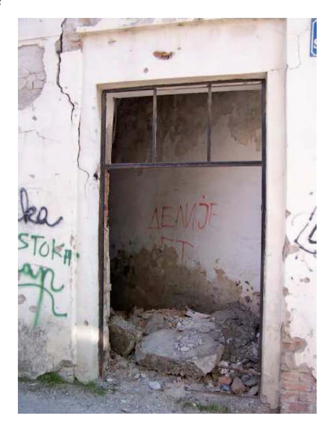
Figure 1 "Delije" written in a Vukovar shell

out of town, stand the ruined remains of Vukovar's water tower (Figure 2), which has since become a symbol of the suffering endured by the town's inhabitants. At the base of this fragile structure, just above the piles of debris that have fallen from it, one can read the initials 'B.B.B.' stained in blue across the weathered concrete. This acronym is short for Bad Blue Boys, the Dinamo Zagreb supporters' group whose members were among the first to join the incipient Croatian Army in the early 1990s, taking their Dinamo emblems and flags off to the front with them. [5]