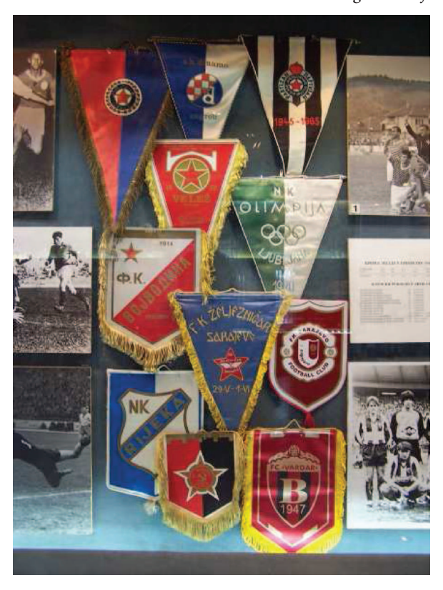
Figure 4 The pennants of Hajduk Split, Dinamo Zagreb, Partizan Belgrade, Velež Mostar, Olimpija Ljubljana, FK Vojvodina, Željezničar Sarajevo, FK Sarajevo, NK Rijeka, Sloboda Tuzla, and FC Vardar. Representatives of Croatia, Serbia, Bosnia, Slovenia, and Macedonia

of Yugoslavia and the inauguration of a number of the country's most successful teams, including: Red Star Belgrade, Partizan Belgrade, Dinamo Zagreb, FK Sarajevo, Proleter Zrenjanin and Spartak Subotica. [30] Meanwhile, the meanings behind these names reveal the extent to which Communism and football became entwined. With the exception of FK Sarajevo, all of the above names can be interpreted along ideologically Communist lines. The Communist origins of Crvena Zvezda (Red Star) and Proleter (Proletarian) are obvious, while Partizan (the name of Tito's victorious Communist liberation force), Spartak (which is named after a legendary local Partizan fighter) and Dinamo (a name with a long association with football across Communist Eastern Europe and the Soviet Union) are also highly symbolic. Moreover, at the same time as these Communist-endorsed clubs were being founded, others, with historic links to ethnic nationalism, were being forcibly disbanded by Tito's incipient regime. For example, the traditionally Croat nationalist club Zrinjski Mostar and the ethnically Serbian Slavija Sarajevo were both condemned to