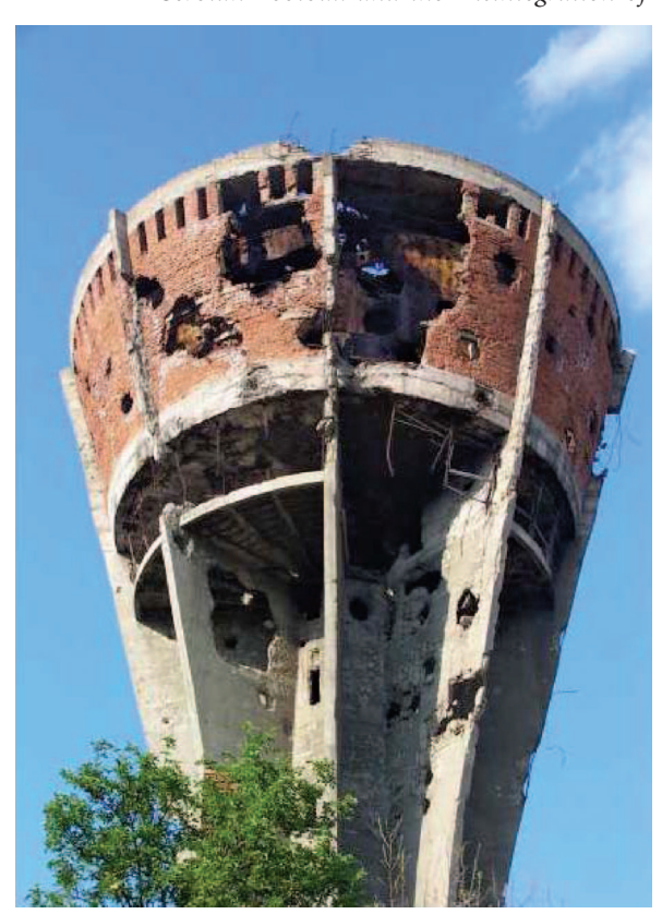
Figure 2 Vukovar's symbolic water tower

a man accused of unspeakable war crimes was hailed as a hero by many of Belgrade's football supporters. Wilson fittingly describes this type of ritual: 'In that act, redolent both of a general displaying the standard of a vanquished enemy and of a hooligan showing off the colours of a rival fan he has beaten, football's pact in the Balkan horrors is laid bare.' [7]