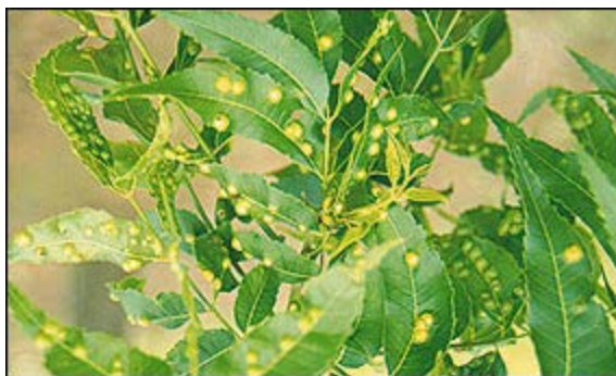
Figure 4 Damage to foliage by pecan phylloxera.