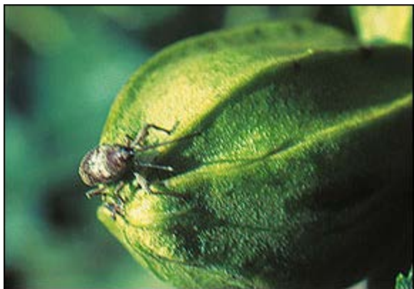
Figure 3 Adult pecan weevil on a mature nut.