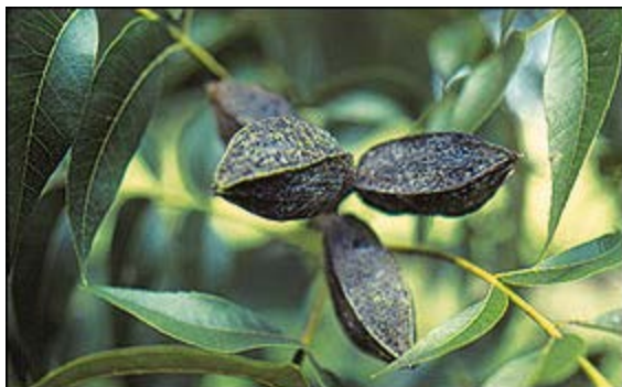
Figure 6 Severe scab infections on nuts. These nuts will drop prematurely or become sticktights.