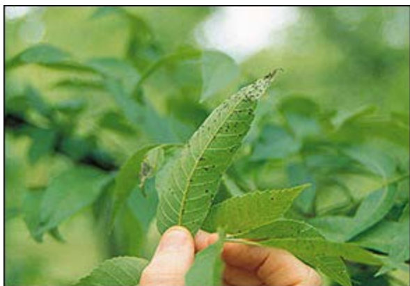
Figure 5 Early scab infections on underside of leaf.

PS first appears as small, circular, olive-green spots that turn to black on the newly expanding leaves, leaf petioles and nut shuck tissue (Figures 5 and 6). All tissues are most susceptible when young and actively growing. Lesions expand and may coalesce. Old lesions crack and fall out of the leaf blade, giving a shot-hole appearance. Nut infections cause the greatest economic damage. Early infections may cause premature nut drop but more commonly cause the shuck to adhere to the nut surface, causing sticktights. Late infections can prevent nuts from fully expanding and decrease nut size.