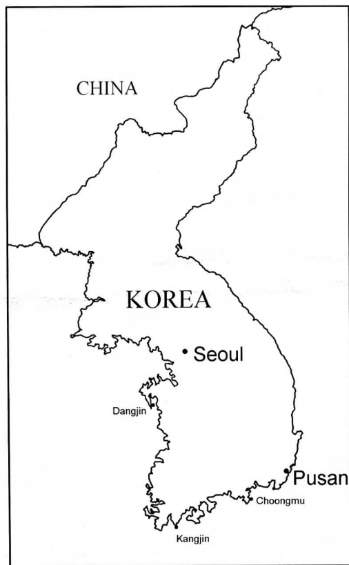
Fig. 1. Farmed rockfish, Sebastes schlegeli Hilgen-dorf 1880 sample sites.

was removed and the gill arches sequentially excised and examined for parasites. The total number of parasites on each hemibranch was recorded for each gill arch before placing the gill arch into a 50 ppm solution of MS 222 (tricaine methane sulfonate). The use of a parasite narcotic such as MS 222 assisted the dislodgement of parasites from the arches. Any parasites still remaining attached to the gill filaments were carefully teased out using a mounted tungsten needle and a paintbrush. Specimens were recounted to confirm the number of each species per gill arch before they were transferred into fixative. The parasites were passed briefly through Berland's fluid to allow relaxation of the tissue before specimens were stored in 10% neutral buffered formalin or in 80% ethanol.