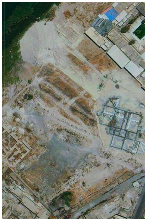
Figure 6. Mosque and sacred place of al-Nabi Sheet after the events

Sometimes, instead, it was easy to detect the ruins that were moved not far from the original position of the monuments as, for example, the case of the Mosque and sacred place of al-Nabi Sheet, see top left of figure 5. The mosque and sacred place were completely destroyed (Fig. 6) but it's easy to detect that at least one part of the ruins, that appears to have the consistency of a thin dust, was unloaded directly on the river bank near here (still Fig. 6) probably using a bulldozer.