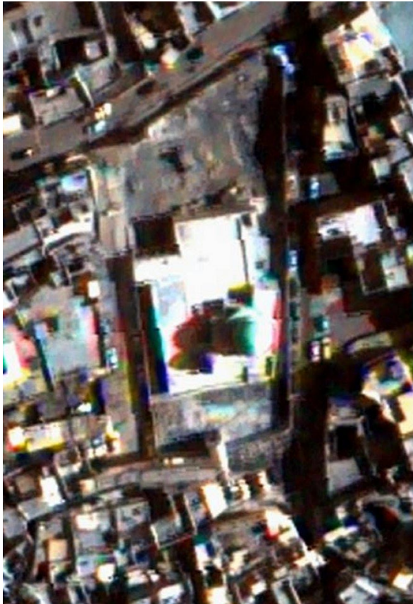
Figure 7. Complex of the mosque dedicated in 1300 to the Prophet Nabi Jirjis in Nineveh before the events