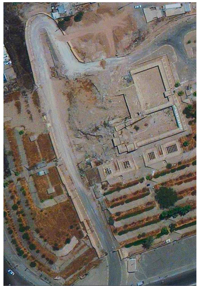
Figure 4. Mosque of Profet Nebi Yunus after the events

The destructions were not always easy to detect, in fact, in some cases, the ruins were completely erased and the space left reused. A simple visual observation, in an urban complex texture as the one in which we're working, led to a very little number of identification, so some sites, chosen by Iraqi technicians, and positioned on paper maps, were identified on the acquired