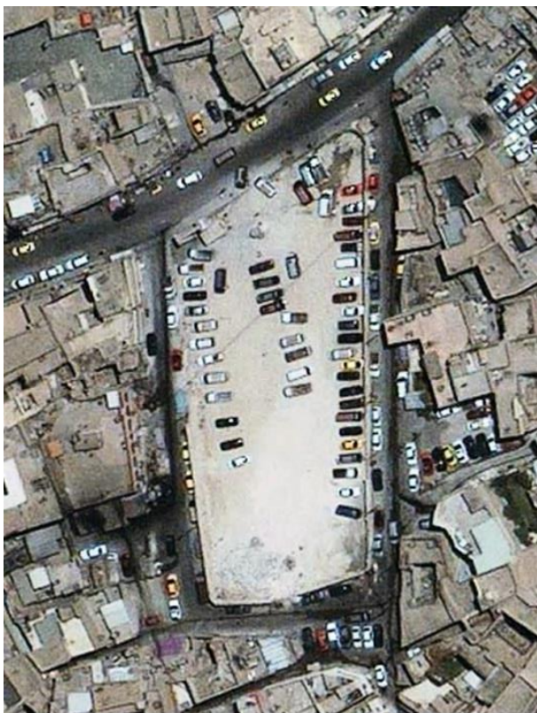
Figure 8. Complex of the mosque dedicated in 1300 to the Prophet Nabi Jirjis in Nineveh before the events

This details hints a technical and project work of disassembling of the monuments. Still in this case, the before image presents evident flaws.