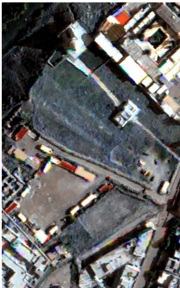
Figure 5. Mosque and sacred place of al-Nabi Sheet before the events

to an interpolation flaws. These flaws seems to have effect not only on the geometry but also on the pansharpening results, in fact some unnatural colours appear in correspondence of the “jigsaw” areas. This is probably due to a geometric misalignment that causes wrong overlapping of the pixels of the different bands.