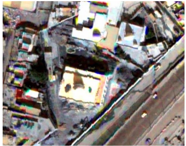
Figure 9. Example of “before” destruction of contiguous buildings in Nineveh

This details hints a technical and project work of disassembling of the monuments. Still in this case, the before image presents evident flaws.