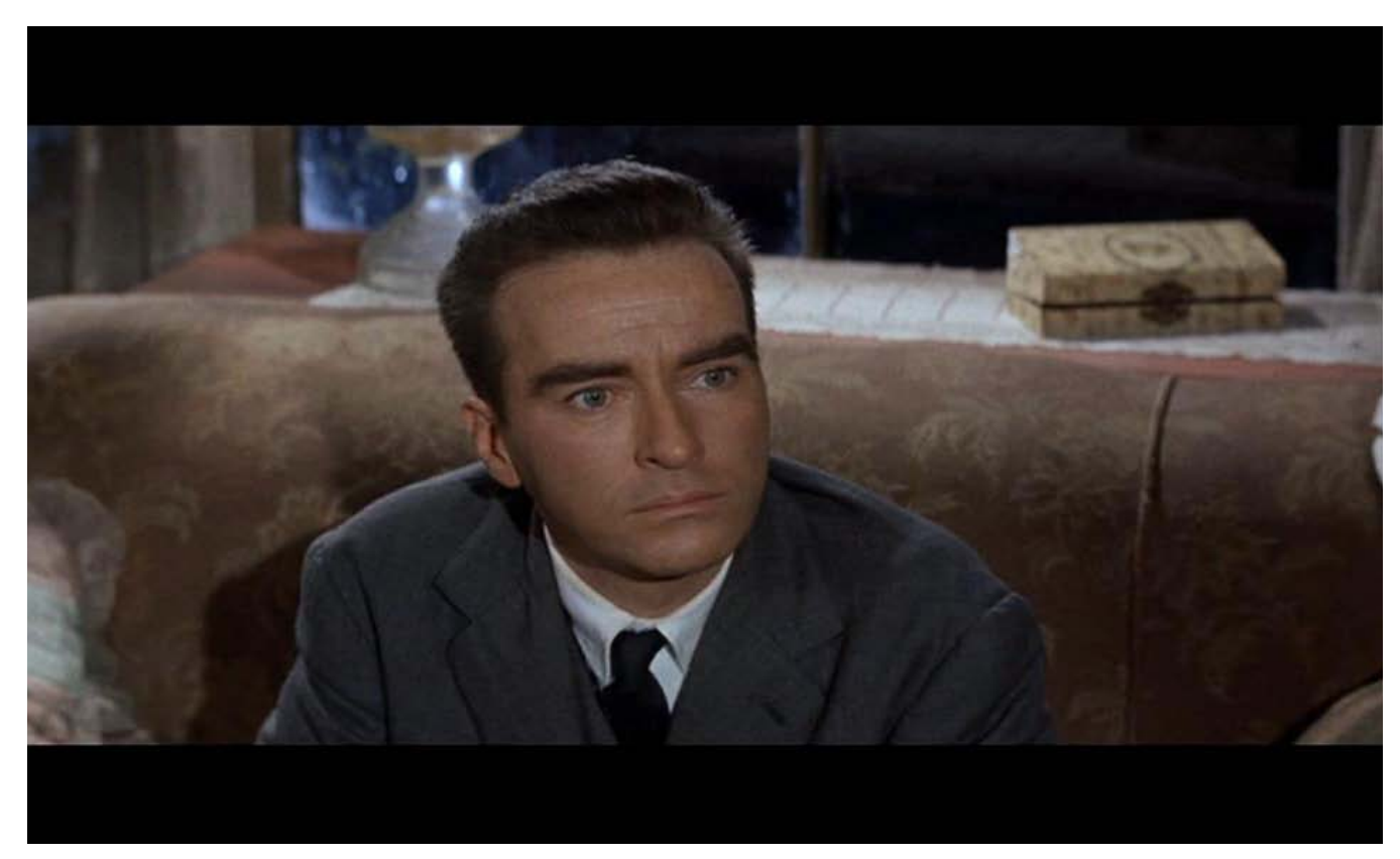
Man and boy. Montgomery Clift as Chuck Glover in Wild River (1960). (color figure available online)

ambiguity of youth. The perception of Clift as a "boy" is not only a reflection of his established star persona, but also a direct result of his performance in the film: his speech is inflected with pauses and hesitations, his eyes are alternately wide-open and elusive, and his movements show both anxiety and desire. Although these boyish connotations are best expressed in Clift's love scenes with Remick, where they inform Chuck's unsettling characterization as a grown man who is not a "real man," they are also crucial in marking the TVA agent as an outsider, ill-fitted to the demands of conventional, straightforward masculinity. Clift's construction of Chuck as different from the other men, by virtue of being more of a boy, is given expressed acknowledgment in the film, from its first scene at the TVA office to later on in the narrative, when a drunken Chuck has fallen asleep on the ground, Mrs. Garth observes him and comments on how small he looks. Indeed, Kazan (who was fifty years old when directing Wild River, thus, hardly a likely father figure for Clift) remarks on the problems he had with the actor