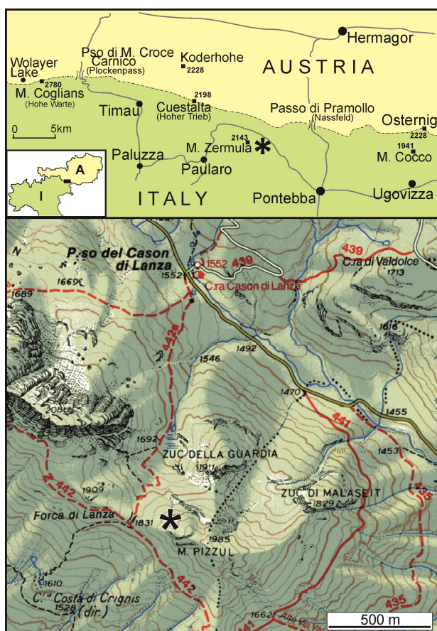
Figure 1. Location map of the Pizzul West section.

The Pizzul West (PZW) section is located in a First World War trench on the western flank of Mt Pizzul at altitude. 1905 m. The section can be reached with a 1.5 hours hike from Passo del Cason di Lanza via path n. 442a up to Forca di Lanza, and then on an unnumbered path to the top of Mt. Pizzul.