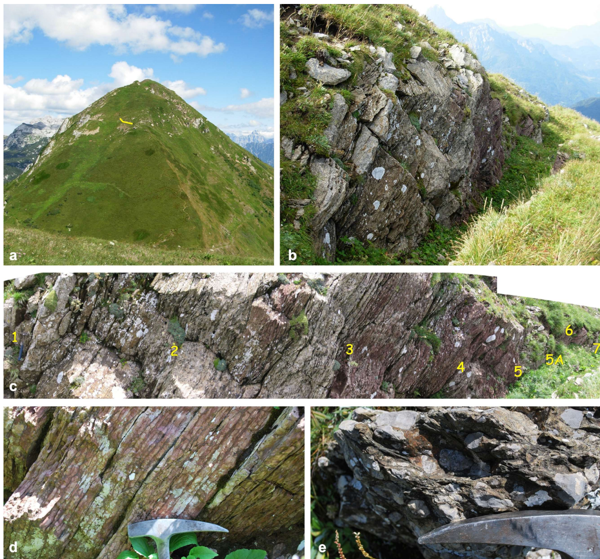
Figure 2. Views of the Pizzul West section showing the location of the conodont samples (after Mossoni et al., 2013). Views of the Pizzul West section. A. Panoramic view of Mt. Pizzul with indicated in red the position of section; B. general view of the section in the First World War trench; C. the undisturbed part of the section, with location of samples; D. detail of the reddish nodular limestone; E. the irregular level constituted by gravels and cobbles scattered in a grey micritic cement (sample PZW Z).

The grey-ochre nodular limestone consists of a wackstone-packstone similar to the red one, but without the haematite precipitations that most probably give the red color to the former unit.