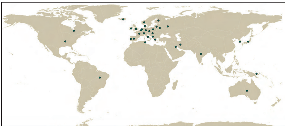
Figure 1. Map of countries which the 17 th ICA 122 participants came from.

The 17 th International Colloquium on Amphipoda was opened by James K. Lowry & Alan A. Myers; they reported a new classification of Amphipoda, establishing the new order Ingolfiellida (Lowry & Myers, 2017). From the first contributions, it pointed out clearly that our knowledge on