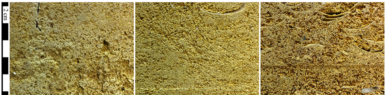
Fig. 1. From left to right, transverse sections of calcarenite samples A, B and C.

This study was carried out on three calcarenite blocks (named A, B and C), coming from two historic constructions built in Palermo in the second half of the 19 th century. Blocks A and B were part of a destroyed rural building located in the neighbourhood of the town, whereas block C has been taken from a residential building close to the historic centre. Archival documents useful to identify the stone quarry have not been found. The macroscopic observation of the stone transverse sections (Fig. 1) shows a substantial difference between block C, where big fossil shells cause macroscopic voids, and blocks A and B, characterised by more homogeneous texture. Each block has been cut in four parallelepiped samples ( 20 \times 20 \times 5 \text{ cm}^3 ) by means of a wet saw. Bulk and real density, porosity and thermal conductivity have been determined for each stone. The hygrometric characterisation has been carried out on calcarenite A through measurements of water vapour transmission, hygroscopic sorption, water absorption and drying.