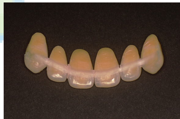
Figure 3: Teeth of the mold are represented by veneers connected to each other on the lingual surface by a fiber