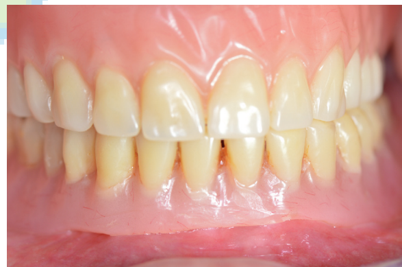
Figure 8: The patient's dentures with the anterior teeth corresponding to that chosen of the Dental VSF System

denture. [31] A method that includes a kit with three transparent esthetic guides had been proposed for fabricating a denture with computer-assisted design and machining (CAD-CAM) technology; in that system, the chosen transparent guide was applied and bonded on the existing denture or wax rim. [32] That system had the advantage of helping the dentist to choose the form and size of teeth in the patient's mouth and not delegating this task to the dental technician, making the dentist's decision easier. However, it was a superficial system because it was based on unrealistic paper drawings, without a three-dimensional perspective, and without the possibility of moving a single tooth.