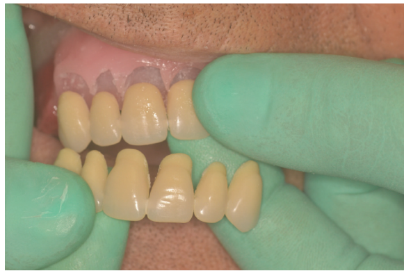
Figure 5: The dental mold may be changed with another from the system