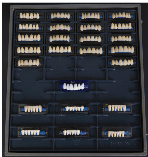
Figure 1: Dental molds of the Dental VSF system. At the centre of the kit an example of radiopaque dental mold, useful for radiological template, is shown