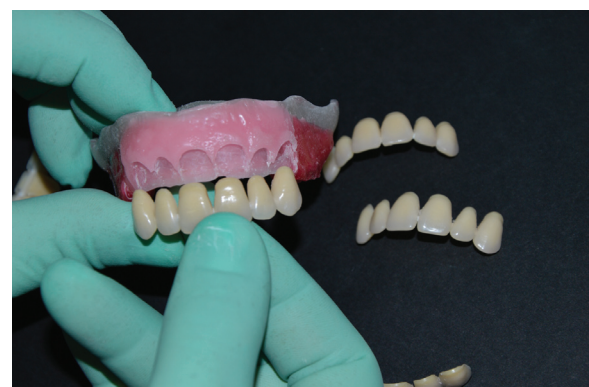
Figure 4: A dental mold is chosen and placed for the esthetic try-in