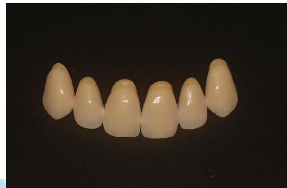
Figure 2: Dental mold of the Dental Veneers Selection Form

At this moment it is possible to provide the appropriate horizontal and vertical overlap, to change, if necessary, the