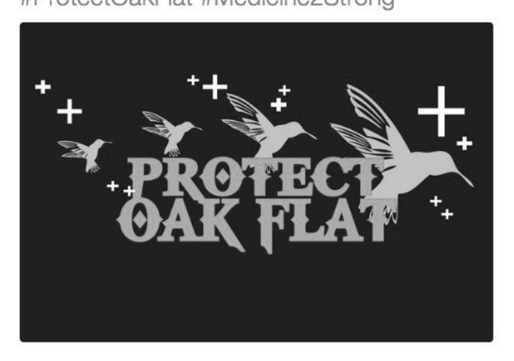
Figure 2. Screenshot of Apache Stronghold's first Twitter post from April 20, 2015. The post is a combination of four hashtags and an image macro (i.e. meme). The image macro depicts four hummingbirds, cross symbols, and the text "PROTECT OAK FLAT".

Apache Stronghold @ProtectOakFlat · 20 Apr 2015 #SaveOakFlat #ApacheStronghold #ProtectOakFlat #Medicine2Strong