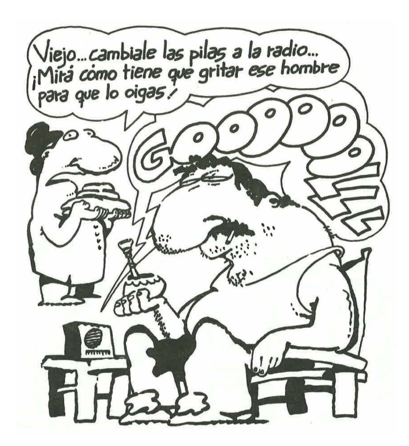
Figure 1. El fútbol es sagrado: An Argentine macho listens to a soccer match.

scene included in Fontanarrosa de penal (2013), two players discuss their goalie's fear of being demasculinized by the opposing fans as the word bubble reads: "La caballerosidad deportiva tiene sus contras. Vos no te imaginás los goles que le han hecho a nuestro arquero por no querer darle la espalda al público que está detrás de su arco." Here, the reader interprets how the goalkeeper must not only defend the penetration of his goal, but also watch his back from imposing hooligans or barras bravas who wish to verbally or physically dominate him.