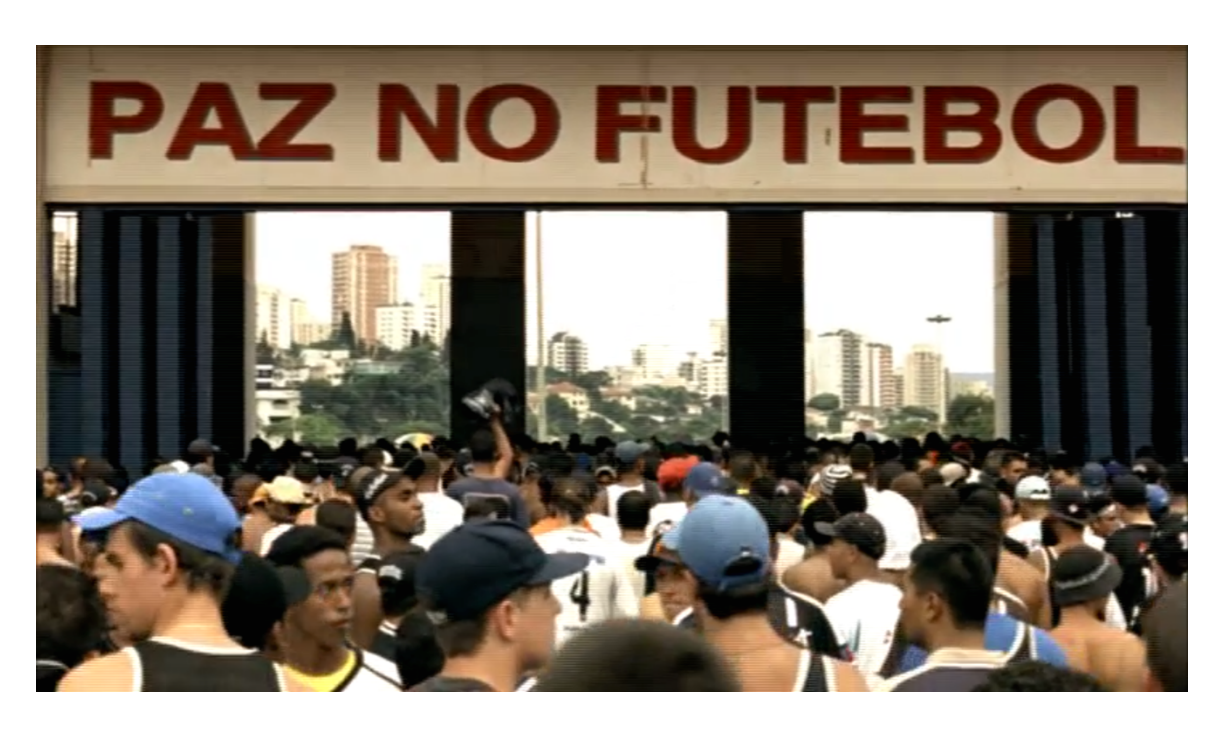
Figure 9. O casamento de Romeu e Julieta: Fans exit Pacaembu.