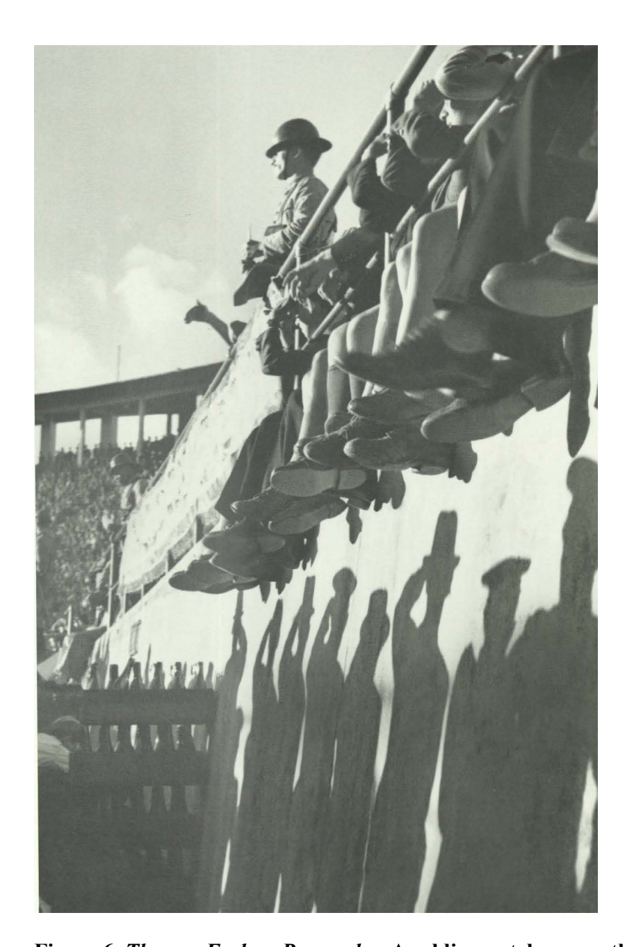
Figure 6. Thomaz Farkas, Pacaembu: A soldier watches over the crowd.

visual effect produced by the angle gives the soldier a towering and authoritative presence over the attendees. The shot also provides evidence of the heightened efforts of government control within these confines. This man and his fellow solider pictured to the left of the frame appear to guard a section of torcidas uniformizadas , suggested by the banner hanging from the railing in between them. Aside from representing another