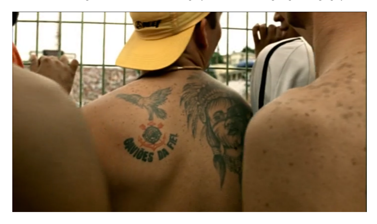
Figure 7. O casamento de Romeu e Julieta: Members of the Gaviões da Fiel.

their dedication to Corinthians and their torcida , as demonstrated by tattoos bearing the group's hawk, name, and team emblem (see figure 7). A separate shot also shows the fans performing one of their most effective techniques in gaining visibility. The torcida raises their bandeirão , a giant black banner that displays the mentioned group iconography.