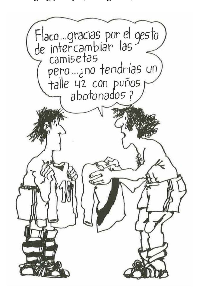
Figure 2. Fontanarrosa de penal: Two players swap jerseys.

from Fontanarrosa de penal shows two semi-nude players from opposite teams exchanging jerseys (see figure 2). While in other settings, one might question this act as a