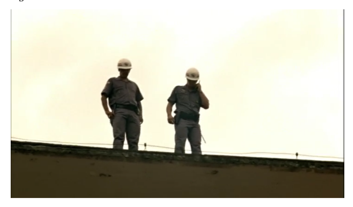
Figure 10. O casamento de Romeu e Julieta : The Polícia Militar gaze down at fans. the camera cuts to an upward-angled shot of two guards dressed in gray uniforms and white helmets—most likely a part of São Paulo's Polícia Militar—that cast their gaze downward towards the crowd (see figure 10). Then, the viewer is provided with a bird's