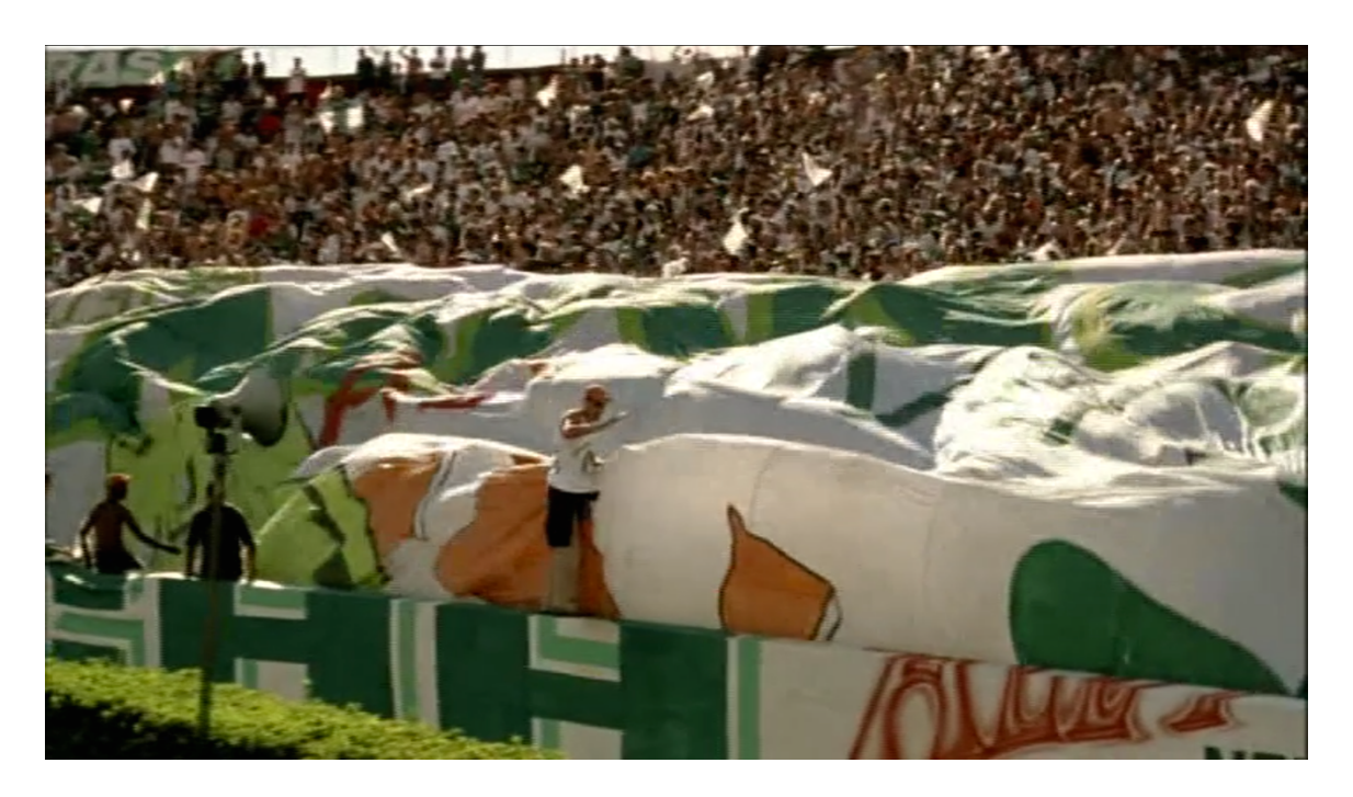
Figure 8. O casamento de Romeu e Julieta: The Mancha Verde raise their bandeirão.

sequences of São Paulo's largest torcidas organizadas demonstrate how these groups use the stadium as a way of combatting their social anonymity through the creation of "non-docile" fan bodies.