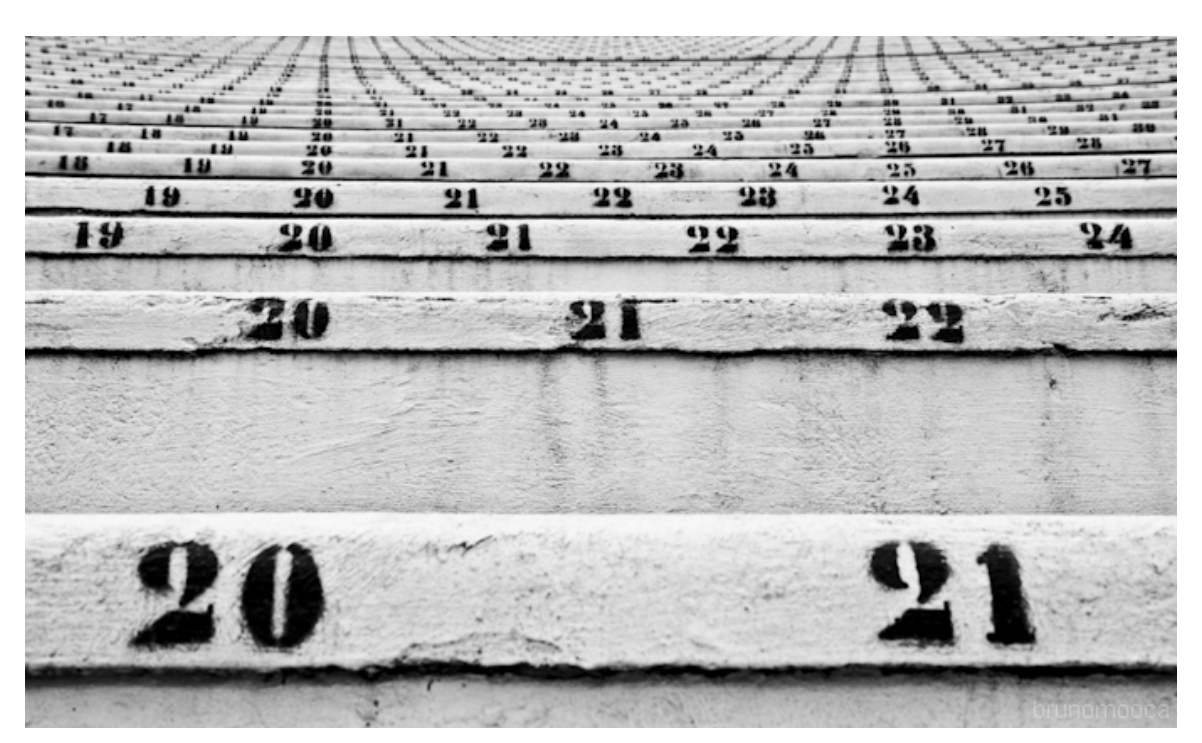
Figure 13. Bruno Mooca: Numbers painted on a Pacaembu geral.

the use of color produces a contrasting effect. Instead of displaying the orderly files of athletes and attendees, Mooca exhibits the various colors that now function to divide and classify the masses. Other images demonstrate the move towards a more controlled geral . Shot at an upward angle, the photographer captures the infinite rows of repeating numbers stamped on the stadium's stepped seats. While this image produces diagonal lines of ascending numbers, another of his photos frames individual seats that escalate with repeating numerals of "69" and "70." The presence of these infinite seat numbers reveals the stadium's capacity for producing "docile" fan bodies, particularly limiting the chaotic and celebratory movements of the torcidas organizadas . This framing also emphasizes how fans—like inmates—are assigned individual numbers, a technique that establishes further connections between the stadium and the prison (see figure 13).