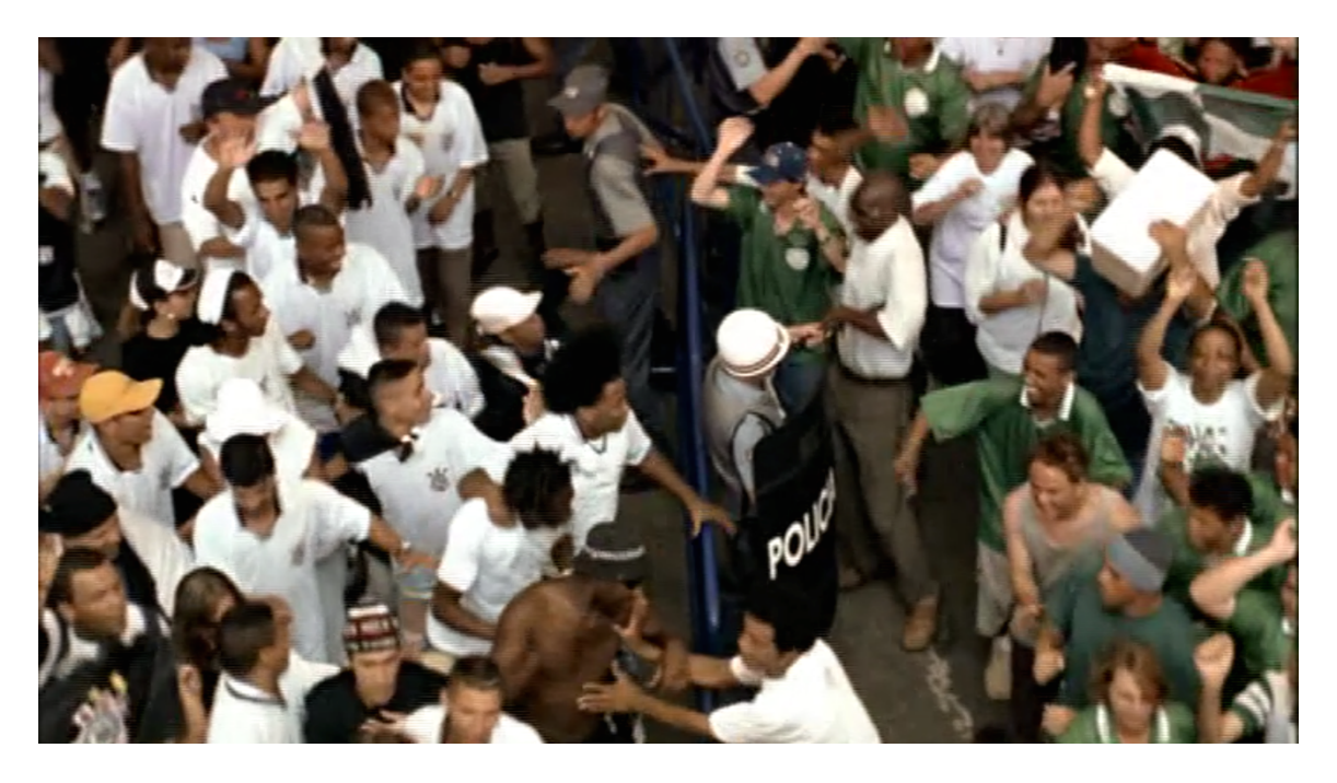
Figure 11. O casamento de Romeu e Julieta: Barriers separate fans.

eye view of the fans, and blue metal barriers and security forces armed with black shields divide both the frame and the separate torcidas (see figure 11). Felipe Lacerda's editing touch suggests that "peace" will be the result of increased militarization and State surveillance. Furthermore, the dividing practices carried out by these forces, combined with the normalizing military gaze, allow for stadium authorities to watch and control fans, thus transforming the space into a panoptic structure.