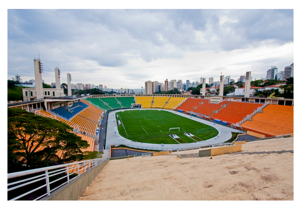
Figure 12. Bruno Mooca: Pacaembu's colored seating sections.

Futebol that honors the country's soccer past. Bruno Mooca (1982-), a contemporary photographer and photojournalist based in São Paulo, offers a ghostly view into the stadium's former years. Taken in an empty Pacaembu in 2011, Mooca's work not only captures the traces of the stadium's most recent disciplinary tactics, but also hints at the abandoned future of those that lack state-of-the-art amenities, individual seats, and surveillance technologies.