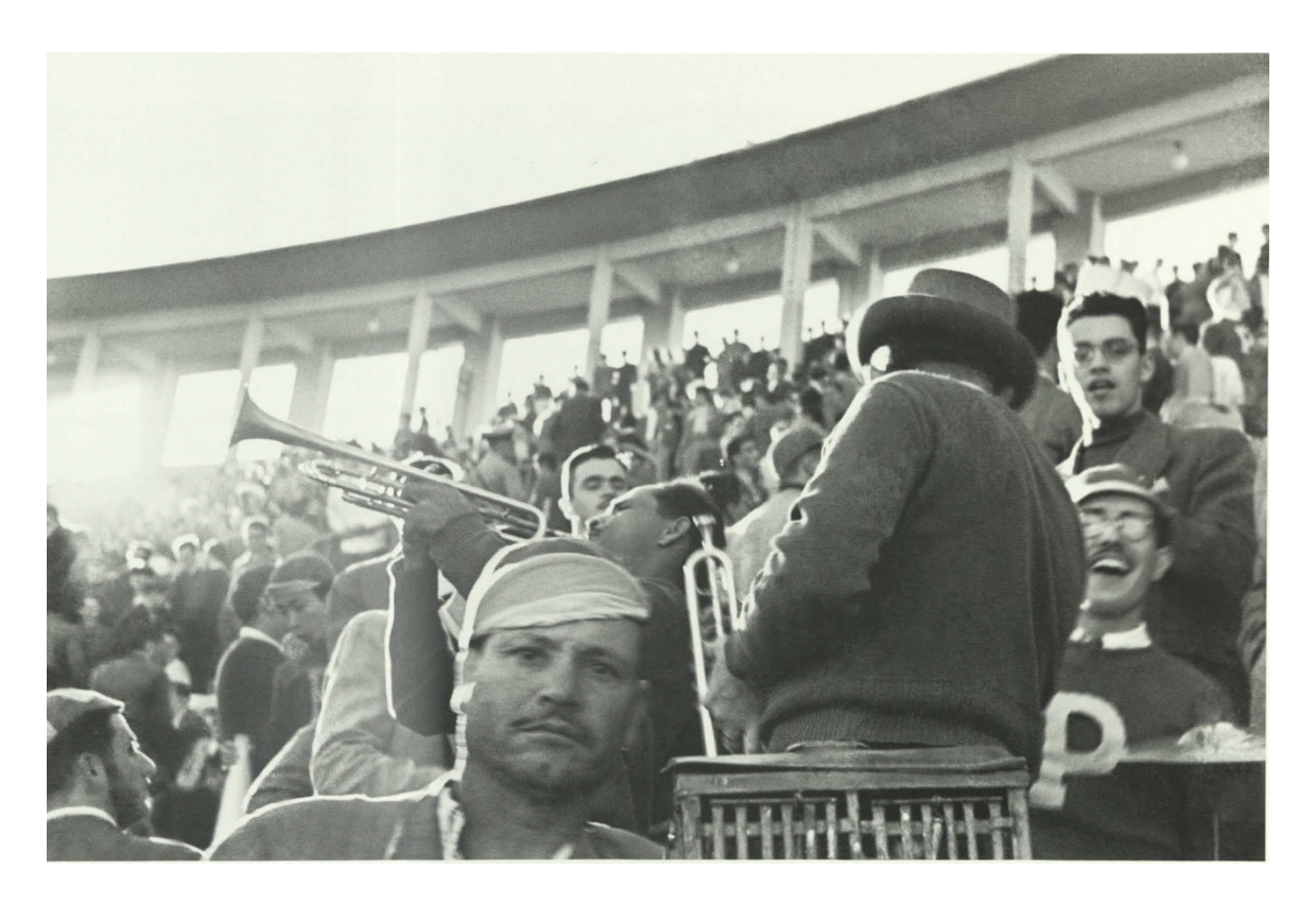
Figure 4. Thomaz Farkas, Pacaembu: The Palmeiras torcida celebrates.

The photograph provides no obvious clues to these men's ethnic backgrounds, but the notable presence of Italian immigrants within the city and associated with Palmeiras leads the spectator to assume that many of those pictured might share these origins. While this is not certain, the photo does prove soccer's capability of fomenting a sense of common urban identity, symbolized by the torcida 's matching uniforms. Another curious detail is the participation of a man with Asian facial features to the left of the frame, just under the outstretched trumpet. Also sporting one of the torcida 's sweaters, the man possibly forms a part of São Paulo's historic Japanese community. Due to Brazil's shortage of cheap labor after slave abolition in 1888 and Japan's desire to export their surplus of agricultural workers, around 189,000 Japanese immigrants moved to Brazil from 1908 to 1941. Representing the largest diaspora of its kind, more Nikkei currently