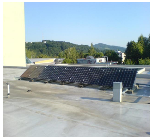
Figure 2. Photovoltaic panels.

On the roof of the building FAI TBU is a small photovoltaic plant. The system consists of 9 photovoltaic panels with a total area of 11.25 square meters. The panels used, are of the type of polycrystalline photovoltaic cells. The producer of these panels has declared an energy efficiency of 15 % (for angle of the panels surface inclined from the horizontal one of 45 ° with the southeast azimuth of the normal direction to the panel surface). Installed panels are shown in figure 2.