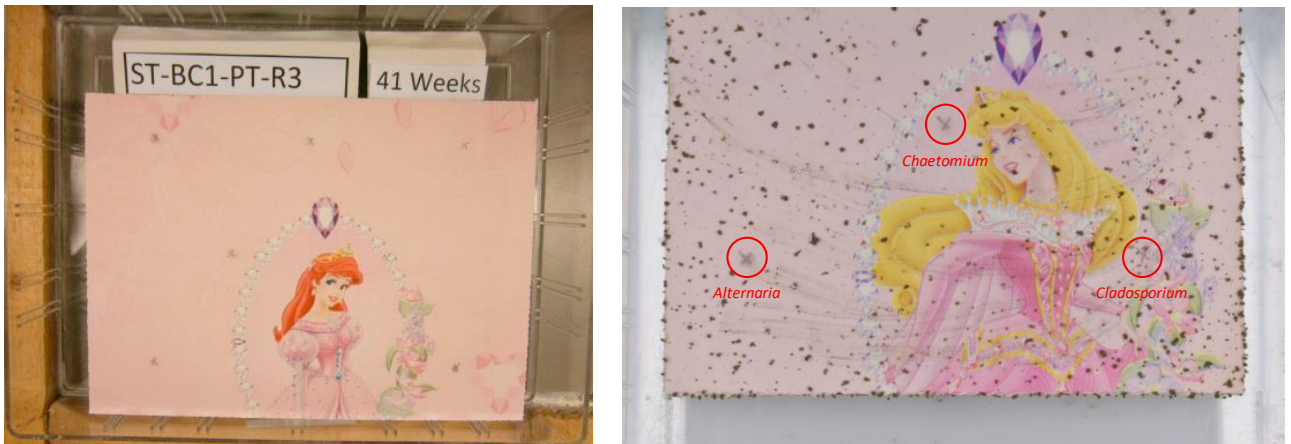
Fig. 2. Left: Sample with aerated cellular concrete and wallpaper. No growth is seen even after 41 weeks at 20 °C and 90 % RH. Right: Sample with gypsum board and wallpaper 4 weeks after adding 100 ml sterile water (rotated left 90°). The black growth is Chaetomium .

The samples were monitored on a daily basis during the first week, and afterwards on a weekly basis. The samples, which were under constant conditions of exposure, were followed for 41 weeks and the growth was assessed visually and photographed (see Fig 2, left). The samples in cyclic conditions were assessed with a stereo microscope. “Growth” was defined if air mycelium was visible at the inoculation location.