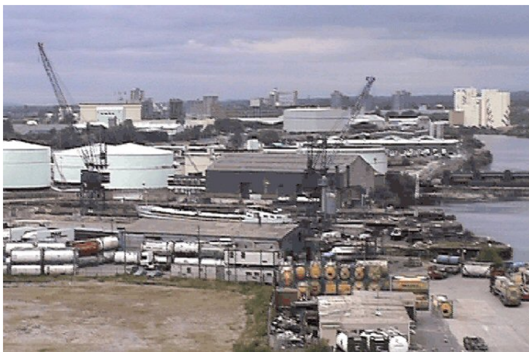
Trafford Park, Manchester

Issues: groundwater management and aquifer protection