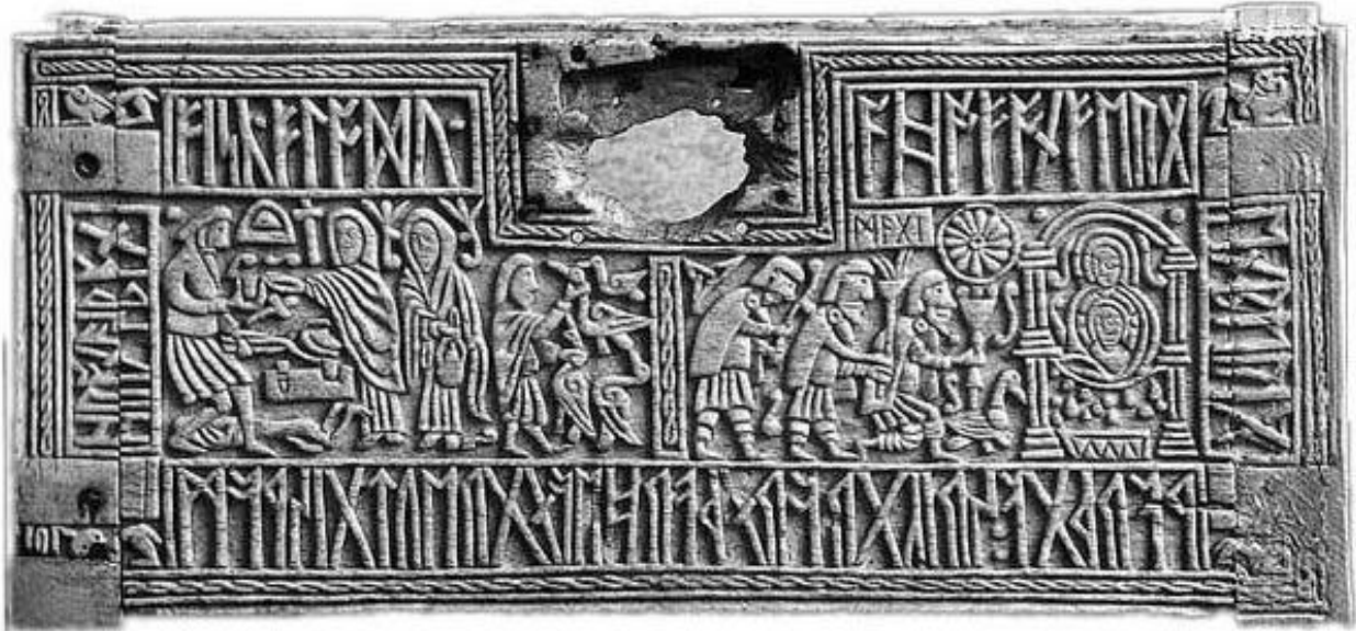
Franks Casket Front Panel

poet. Thus, Deor attempts to reconcile his troubles with difficulties faced by principal figures in Germanic mythology, ending each section with the refrain: 'þæs ofereode; þisses swa mæg' – that passed away, so might this. So, Wayland lives in exile; King Nithhad has captured and maimed him. That passed away; this may too. 10