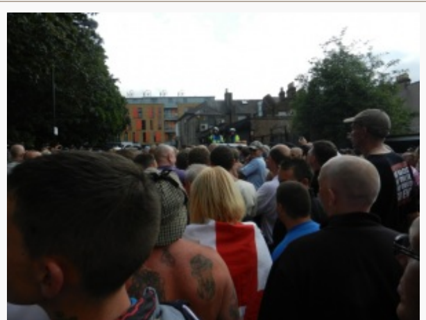
Demonstrators are 'contained' close to Waltham Forest Magistrates Court

After we had all been read our rights, told what we had