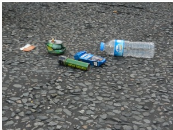
The remains of the march: a scene from the final kettle