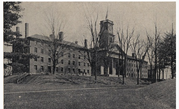
Amherst College Chapel and Dormitories