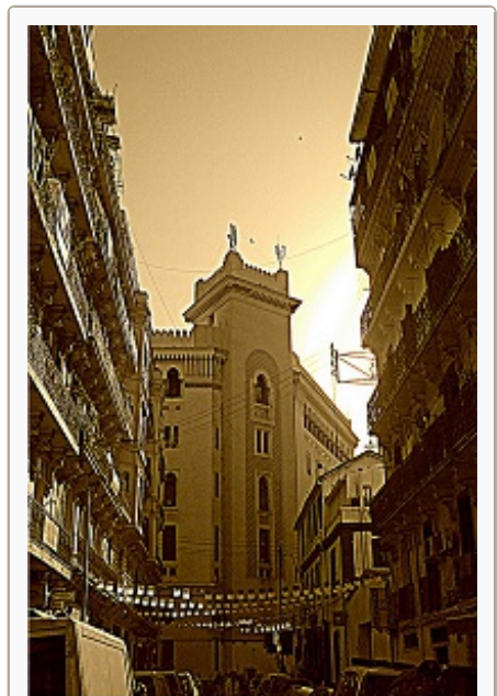
(Telemly district of Algiers, Algeria)

But the truth is, I love a case study. Of course, case studies are informed by broader frameworks and in turn serve to illustrate, enrich or challenge the national or international picture. But what I love about case studies is the richness of detail which enables you to ‘get under the skin’ of a society. I like mentally mapping out street names I recognise in primary sources, tracing the itinerary of one individual of no obvious significance through boxes and boxes of archives, reading adverts, obituaries and news-in-brief in