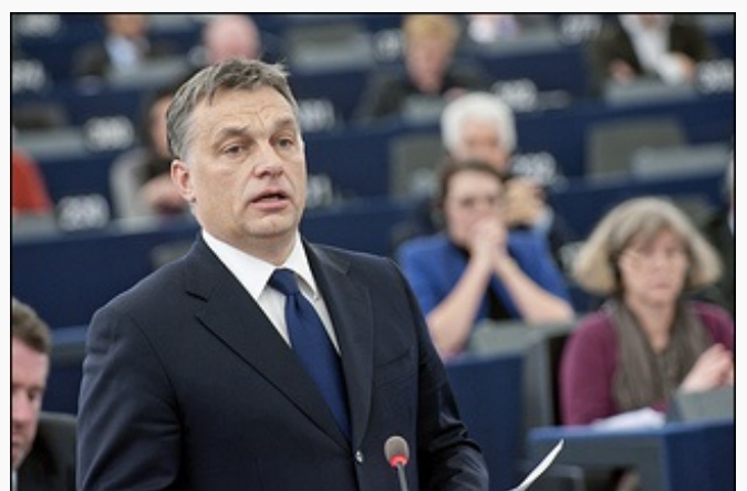
Hungarian Prime Minister Viktor Orbán

New laws were adopted governing the maximum retirement age of judges: the limit was reduced from 70 to 62 years (the general retirement age is 65 years). Hence about 300 judges, including the heads of courts can be sent into retirement. About 25% of judges at the Supreme Court of Hungary are affected. "Spearheading" the body of judges is a new, powerful office, presided over by the wife of one of the governing