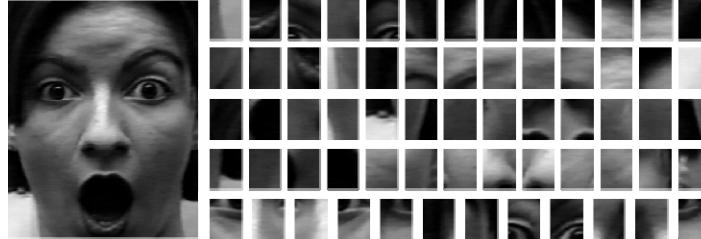
Fig. 3. An example of facial image patches division. Left block: the detected surprise facial expression; right block: divided 64 patches of the facial expression.

Fig. 2 illustrates examples of six types of facial expressions. We only use the peak frame for each facial expression. This database consists of 123 subjects and 593 facial expression sequences in frontal view. Among those 118 subjects are annotated with seven primary facial expressions including surprise, anger, fear, happy, sad, disgust and contempt. In this paper we only test the algorithm for the first 6 facial expressions.