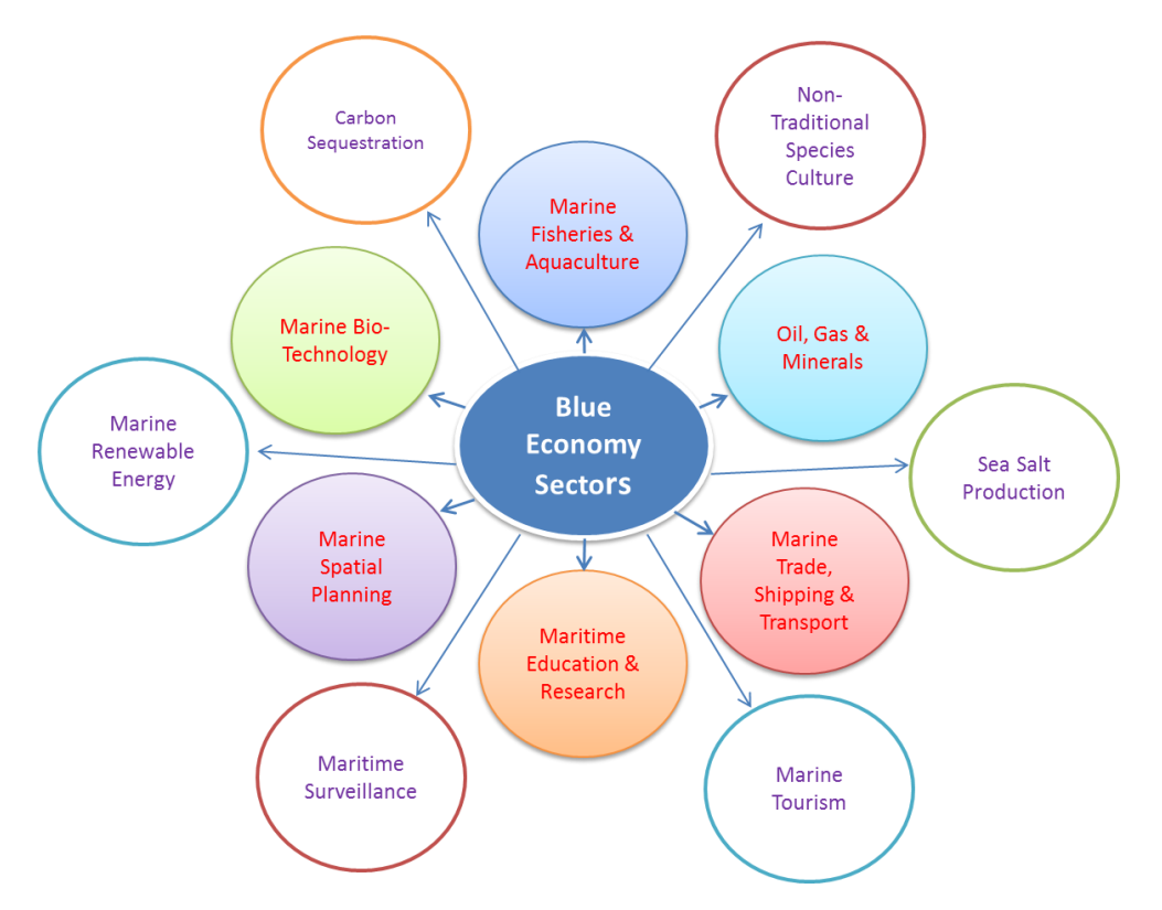
Fig. 2. Major sectors related to blue economy in Bangladesh

Bay of Bengal and coastal regions are the backbone of national economy of Bangladesh. The blue economy can create enormous opportunities to resolve the issues of climate changes at the coastal areas by addressing the challenges. On the other hand, it might generate jobs for millions and bring about tangible changes in the lives and livelihood of the millions of people living along the coastline, in islands and across Bangladesh, if the marine based economic resources belonging with many sectors are managed and governed by principles of biodiversity protection, conservation is community-led and efforts for care are intertwined with a vision of scientific understanding. The past and present status and trends and future potentials of marine based economic resources (Living, non-living and potential other resources) within the identified sectors are summarised in Table 1 and major opportunities of these sectors are detailed in the following paragraphs.