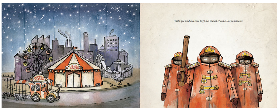
Fig. 1 Illustrations from Historia de un oso . My translation of the text reads: 'Until one day the circus came to town. And with it, the tamers'

Historically, literature has been a place to express utopian visions and subtle criticism of the existing social order. Literature for children has also been used as an effective tool for the dissemination of official ideologies, influencing behaviour and beliefs (Nilsen and Bosmajian, 1996, p. 308; Dorfman, 2009, p. 173). Because the author's own ideology plays a key role when writing for young readers, children's books can also be seen as political acts (Hollindale, 1992, p. 40). Naomi Sokoloff (2005) argues that children's literature "is often less revealing of kids than of ways