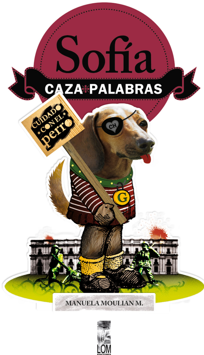
Fig. 2 Cover of Sofía caza palabras

Sofía caza palabras is a graphic novel about eight-year-old Sofia, who grows up under the dictatorship. She writes her secret notebook while trying to make sense of the mysteries that surround her life. The plot follows her dog Garp, named after John Irving's novel, which Sofia's dad is reading. While Sofia tries to understand the meaning of words used in her family, such as "proletariat" and "historic materialism", the dog brings trouble by its peculiar habit: eating books. Sofía caza