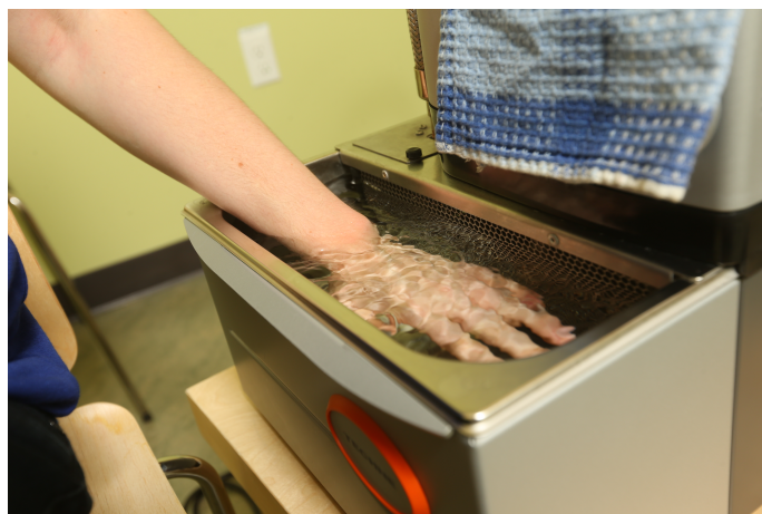
In a cold pressor task children put their hand in cold water for as long as they can (with a maximum of 4 minutes) - example Birnie et al (2011)

Catastrophic thinking about pain is an exaggerated negative attitude towards actual or anticipated pain experiences (Sullivan et al., 1995). Based on evidence demonstrating the importance of catastrophic thinking about pain , we thought that parents could also have catastrophic thoughts about their child's pain. In turn, this could influence what parents feel or do in response to their child in pain. We investigated this in healthy schoolchildren undergoing a painful task such as the cold pressor task (see picture below). We also looked at families of a child diagnosed with leukemia (as part of their treatment children have to undergo a series of painful lumbar punctures and bone marrow aspirations, which are not only anxiety provoking for children but also for their parents).