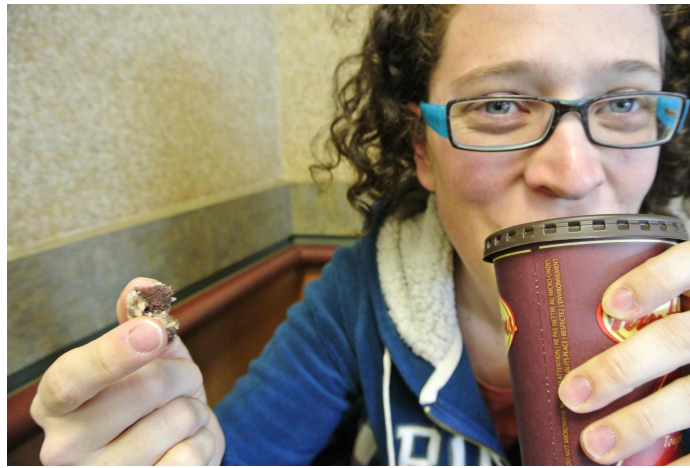
Me enjoying one of many double double coffees at Tim Hortons