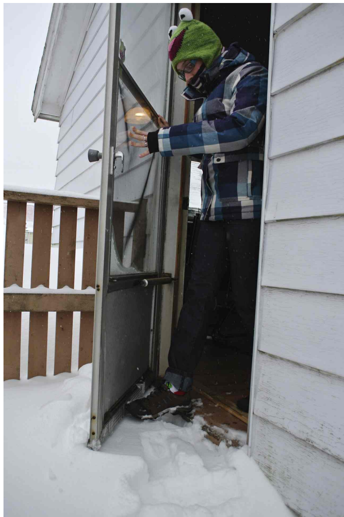
My first winter storm!

I had a good time during my postdoctoral fellowship and can advise everybody to take the plunge and change institutes (even countries!) for an exciting and extremely valuable experience on both personal and academic level. I won't lie, making the personal sacrifices was hard, but I was lucky enough to have a very understanding and flexible supervisor and a long-distance buddy in a lab member who also had the Atlantic Ocean separating her from her husband. To ease the pain a little more, we also flew our Newfoundland over to meet her roots in Canada: