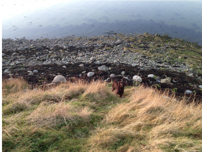
Our flat-coated retriever Iachi enjoying Blakes Hill

You might wonder what happened with the long distance relationship in the mean time. Well, there is no ocean separating us anymore, but it is still ongoing as my husband made a similar exciting jump for his postdoc by moving to Belfast, UK. Living closer together has allowed us to reunite the dogs! Both are now enjoying each other's company again and the (Northern) Irish countryside. Yes, they are equally well travelled ☺.