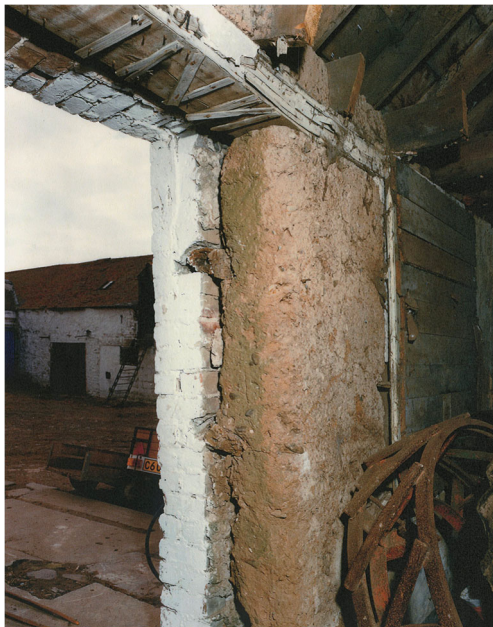
Fig. 6 Brick-faced claywall steading, Caldonshill Farm, Dumfries and Galloway, © Crown Copyright: RCAHMS. Licensor www.rcahms.gov.uk

Indeed, it has been noted that archaeological remnants of rural dwellings from the Iron Age are more prominent in the Scottish landscape than those of the sixteenth century. With extant lay buildings pre-dating the mid-eighteenth century virtually unknown, a common assumption is that poor construction and the nature of materials used resulted in buildings with short lives (Whyte and Whyte 1991). Dyer (1986), as part of the revision of Hoskins’ theory of the ‘Great Rebuilding’, has speculated on the impact that building with crucks (‘couples’ in Scotland) may have had on the quality of peasant buildings, emphasizing the importance of the introduction of stone foundations. Employed as a means of protecting timbers from rotting, these low walls were also ideal for mudwall construction, limiting the capillary rise of groundwater that is otherwise deleterious to earthen building materials. Although the