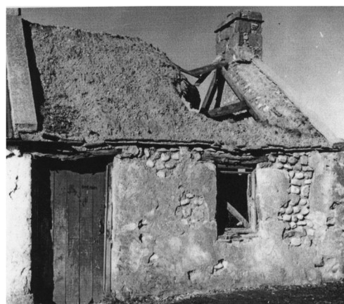
Fig. 10 House built in Auchenhalrig Work, Cowfurach, Banffshire

Earth building continued well into the nineteenth century in Scotland, in spite of the negative influence that Improvement had, physically and metaphorically, on the practice. The combination of vernacular materials in professionally constructed buildings has precedents both documented and in surviving examples, such as a missive letter dating to 1789 relating to the building of a 60 ft long house in Tain with “solid mud, except the corners, door, and window skimshions, Lintols and soles, chimney and chimney heads, Sque and wall tabeling, all of which is to be of the best quarry stones neatly hewed” (MacGill 1909). The combined use of a vernacular material with high quality building stone represents a significant transitional period when the influence of Enlightenment thought was reflected in the built environment. The meeting of traditional and contemporary approaches to construction can also be found in several domestic dwellings in Dumfries and Galloway and in the manorial Kinlochmoidart House,