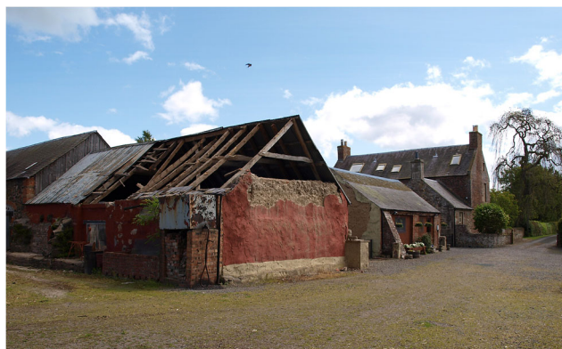
Fig. 2 Flatfield Steading, Perthshire. Later-eighteenth century group of farm buildings, two of which are of mudwall. These were cement-rendered in the 1970s to the detriment of the walling fabric

tradition distinct to the locality around a village in Morayshire in Northern Scotland from which the name derives, used mass earth in combination with prominent rounded boulders. In some instances, straw would be laid between lifts (Fig. 3) with dung, blood, urine, or other organic additives perhaps used to modify cohesion and workability. Surviving evidence of mass earth construction can, therefore, be found across many Scottish landscapes (Fig. 4). Mass earth construction is widely known as ‘cob,’ a term recognized in the south-west of England and in many generalized texts, but also referred to under