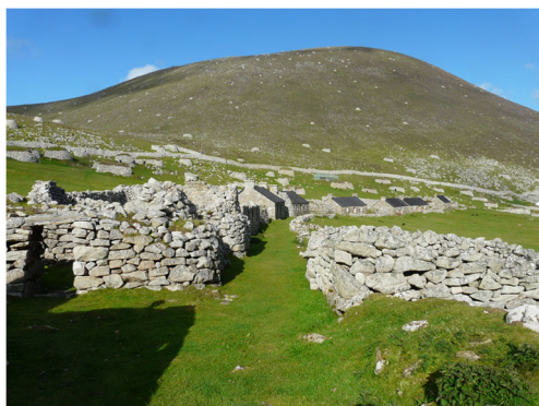
Fig. 1 Stone walled buildings constructed ca. 1860, St Kilda to replace previous earth-built structures

This criticism is not restricted to turf as a construction material and our primary focus here is on the mass earth type of building tradition that was common throughout Scotland. This method saw a mineral subsoil, typically mixed with fibrous matter such as straw, hair, or heather, gravel (though not always) and water, built in layers (or lifts) on top of a low rubble or stone base until a monolithic wall of requisite height resulted (Fig. 2). The vagaries of Scotland’s geology and resultant soils, economy, and culture produced a variety of outcomes in practice such that there is no definitive ratio of materials used across contexts (Stell 1993). Auchenthalrig Work, also known as ‘Clay and Bool’ or ‘Straw and Dash,’ a