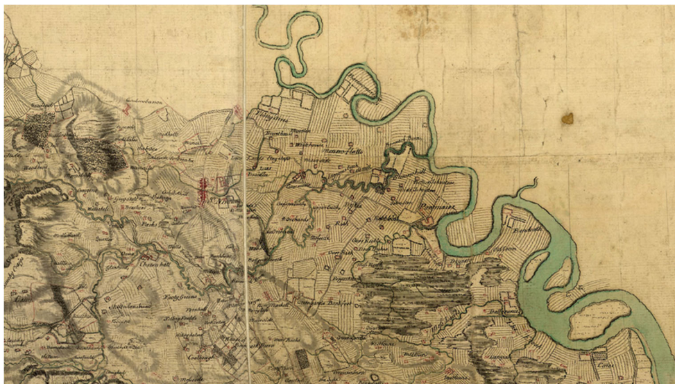
Fig. 8 The settlement at Bannockburn is shown by Roy in the 1750s as being within agricultural land (spanning break in map sheets) with a discrete area of bog peatland lying to the east. (Roy Military Survey of Scotland 1747–1755. © British Library Board, British Library Maps C.9.b 6/7a and C.9.b 6/7b.)

depths of peat were and still are found) and Stirling gives its name to the clay soil Association found locally and that covers over 400 km 2 of Scotland's landmass (Wilson et al. 1984).