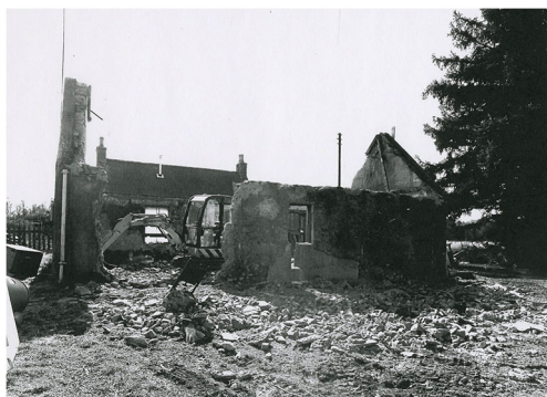
Fig. 9 Claywall structure at Upper Haugh, Alford, Aberdeenshire photographed in 2003, with the somewhat amusing comment of the surveyor: “apparently during demolition”.

Statements regarding the replacement and improvement of building stock are found repeatedly within the General Views , spanning a near 30-year period from the mid-1790s. Nonetheless, sympathetic accounts of traditional methods can be found from within the same body of works. Souter's General View of Banffshire, 1812, follows the typical line in stating that “very considerable improvements have, within these last thirty years, taken place in the erection of farmhouses and offices.” He noted that many farmhouses were “built of stone and clay mortar, having the joining of the stone neatly closed with lime mortar.” And a footnote explains that “In several places in this county the walls of houses and cottages have been built of a composition of mud or clay, mixed with small stones and straw, called Auchenhalrig Work . This kind of wall has been recommended for farm-steadings, in situations where stones are not easily procured, and is said to be cheap, substantial, and durable” (Souter 1812). This stands out as a noticeably more pragmatic approach to the assessment of a type of mudwall construction that was