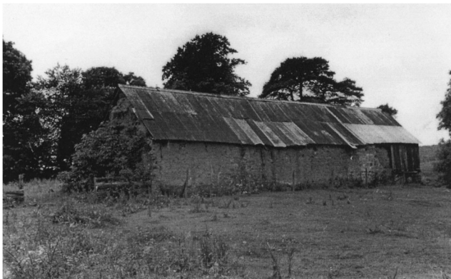
Fig. 7 External view of mudwall steading at Prior Linn Farm, Canonbie, Dumfries and Galloway

The earliest account in the collection is from Æneas Sylvius Piccolomini, the future Pope Pius II, who in the mid-fifteenth century painted what became a fairly typical