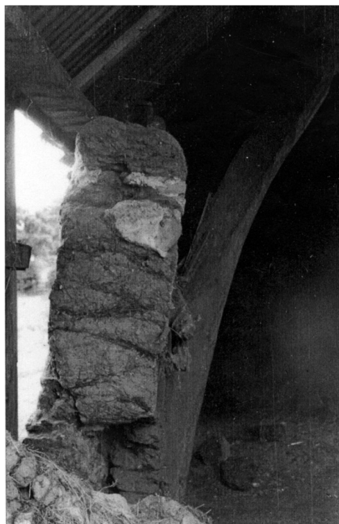
Fig. 3 Mudwall with straw layers included between lifts. Prior Linn farm, Canonbie, Dumfries and Galloway

tradition distinct to the locality around a village in Morayshire in Northern Scotland from which the name derives, used mass earth in combination with prominent rounded boulders. In some instances, straw would be laid between lifts (Fig. 3) with dung, blood, urine, or other organic additives perhaps used to modify cohesion and workability. Surviving evidence of mass earth construction can, therefore, be found across many Scottish landscapes (Fig. 4). Mass earth construction is widely known as ‘cob,’ a term recognized in the south-west of England and in many generalized texts, but also referred to under