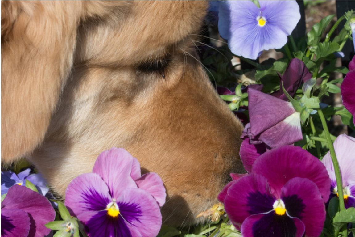
Dogs excel at smelling tests but could humans be trained to be just as good?

All this suggests we have both the capability and opportunity to put our noses to good use. So how do we actually compare with other species? Such experiments are challenging to implement, but the available evidence suggests that we can outperform even rats, monkeys and dogs in perceiving trace quantities of certain odour molecules that, presumably, are more salient in our experience.