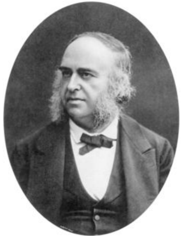
The man behind the myth.

The myth continues to influence researchers. One example is how genetic analyses of olfactory gene function have been interpreted. Of around 1,000 known genes for receptors (special cells that are activated by odours), about 40% are non-functional "pseudogenes" – meaning they do not actually code for odour receptors in the nose. This compares to only about 18% in mice. It has been argued that this indicates that natural selection in humans may have favoured senses such as vision at the expense of smell.