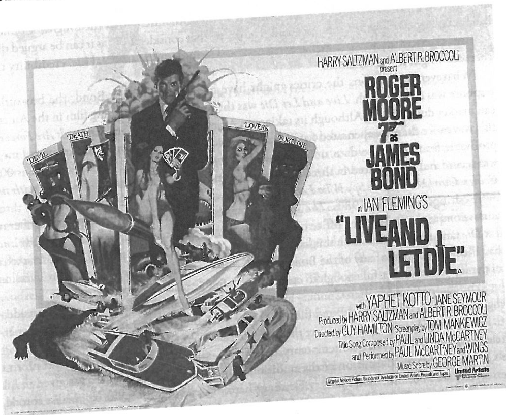
The new Bond arrives in Live and Let Die (1973)

Moore initially signed a contract for three Bond movies, starting with Live and Let Die (1973). It's useful to examine the way in which Eon Productions and United Artists incorporated Moore into their promotional campaign for the first film. The most striking thing about the posters for Live and Let Die is the degree to which the visual imagery of the franchise remained unchanged. This includes such basics as the typeface used, the pose struck by Moore (dressed in black suit and tie, arms crossed, gun raised to the side of his face) and the arrangement of the design in which all of the action (girls, cars, explosions) radiates outwards from Bond. 6 Above all else, the prospective audience are reassured that the formula remains unaltered. Similarly, the theatrical trailers, from which this essay's title is taken, promise business as usual, with the arrival of a new Bond comparatively insignificant in relation to the stunts, chases and exotic locales on offer. 7