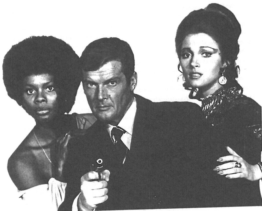
Roger Moore adopts a familiar pose, with Gloria Hendry and Jane Seymour, for Live and Let Die

apparently unscathed by the impositions of the Cold War or the collapse of the Empire. The films toned down these elements, along with the sadomasochistic violence that sometimes characterises the books. Most strikingly, the images of Bond's lifestyle have been altered, taking him away from Fleming's gentlemen's clubs towards a more international style of consumerism. Connery's Bond often resembles an affluent holidaymaker out to enjoy the plush hotels, fine food and drink, exciting nightlife and good times offered by his trips abroad. This is particularly apparent in the depiction of his female conquests. The original Honey of Fleming's Dr No is a childlike waif who comes under Bond's fatherly protection. In the film, she has become Ursula Andress, emerging from the surf clad in a white bikini. The Bond of the Connery films is a charming womaniser, but the aristocratic dominance of Fleming's original has given way to a kind of international playboy whose aim is the pursuit of hedonistic pleasures that might seemingly be open (at least as fantasy) to all 1960s men.