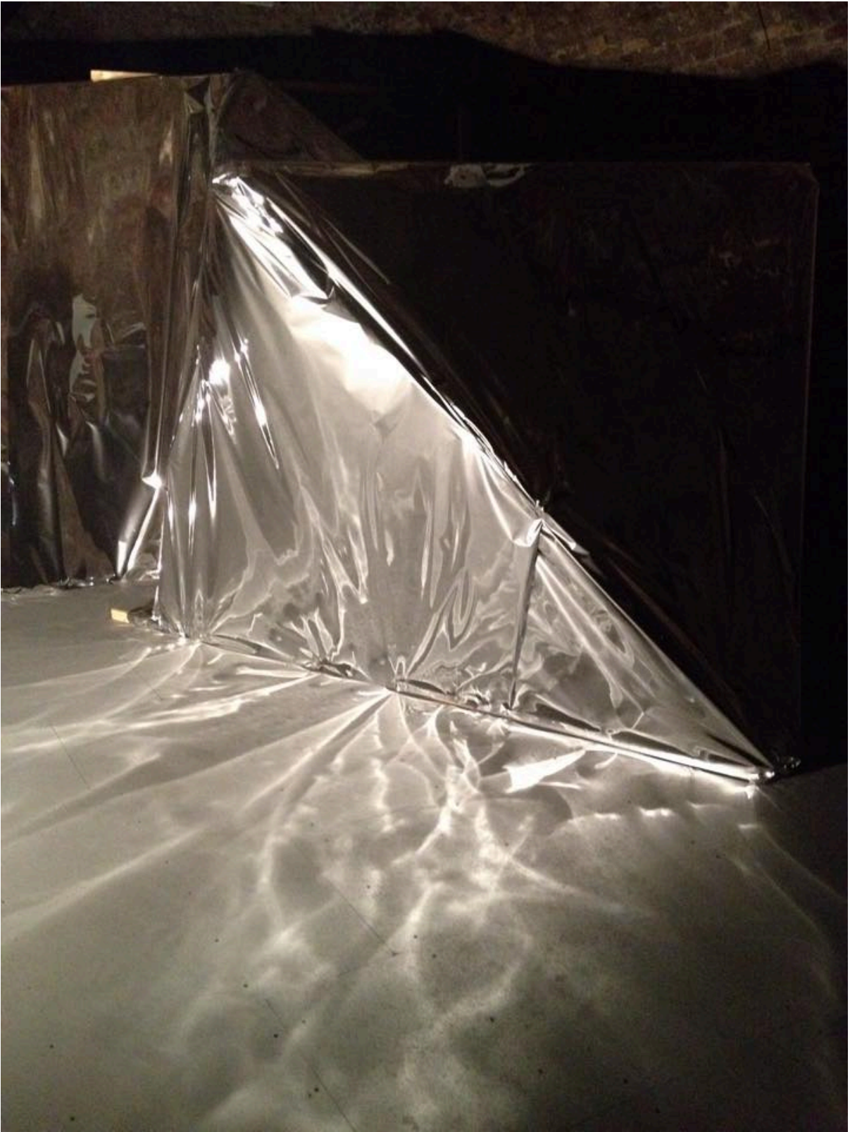
Holmes, D. Images of KKKK in situ (2014).