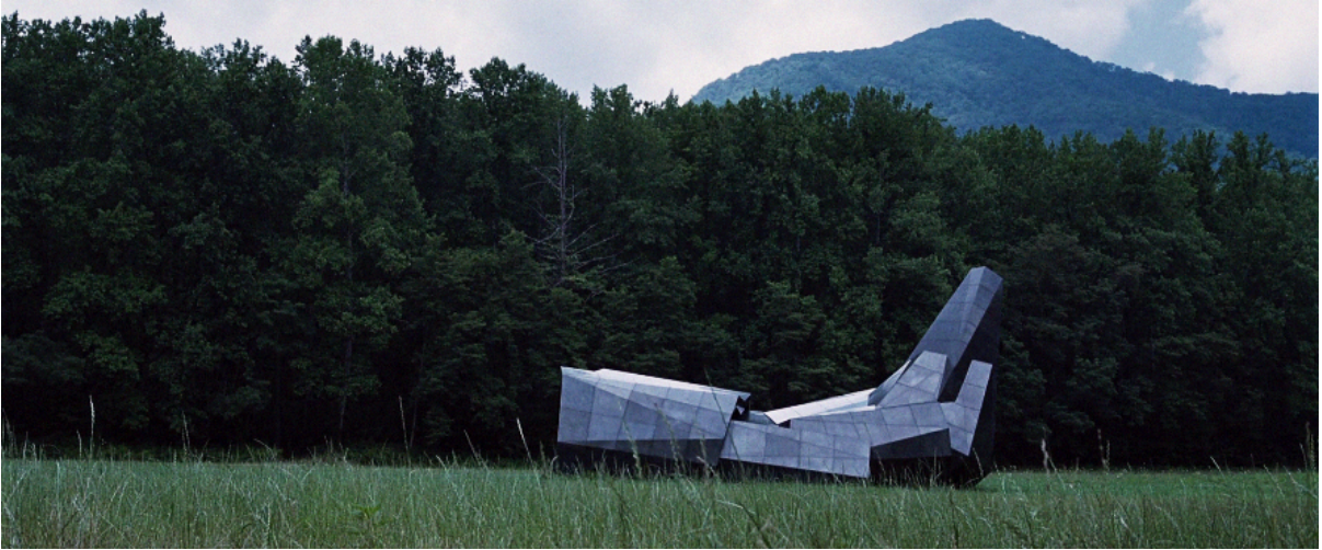
The Cornucopia, The Hunger Games (2012)