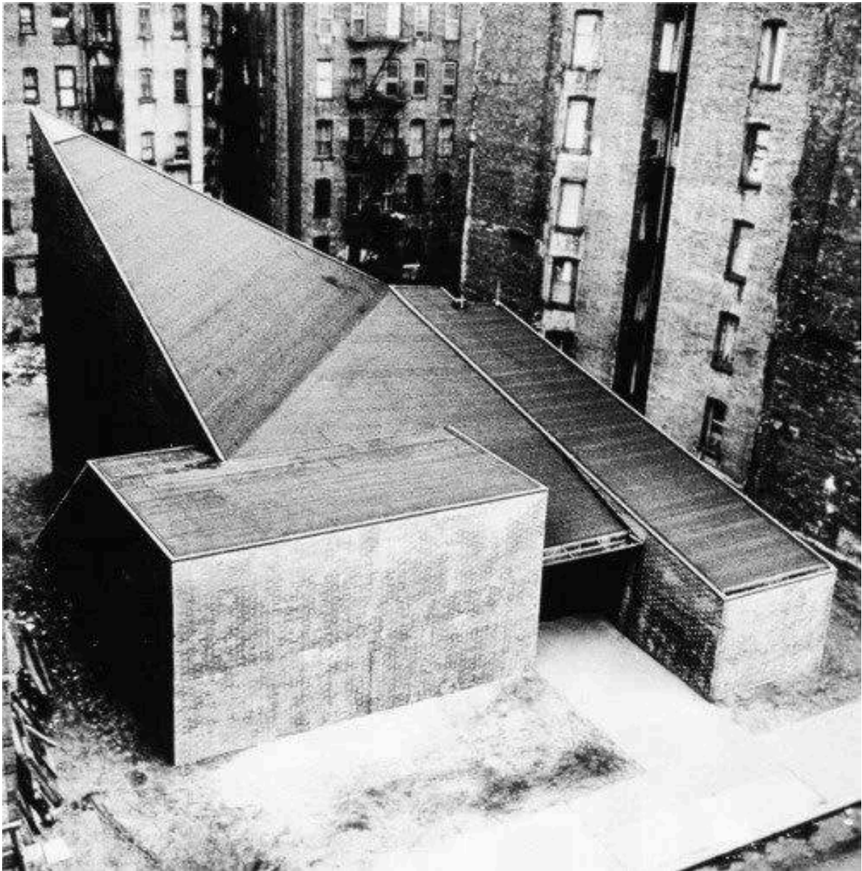
Unknown Architect: Russian early 20 th Century

Images of research, process and result for Material Conjectures presents Kwartz Kapital Konstruktion Kollider