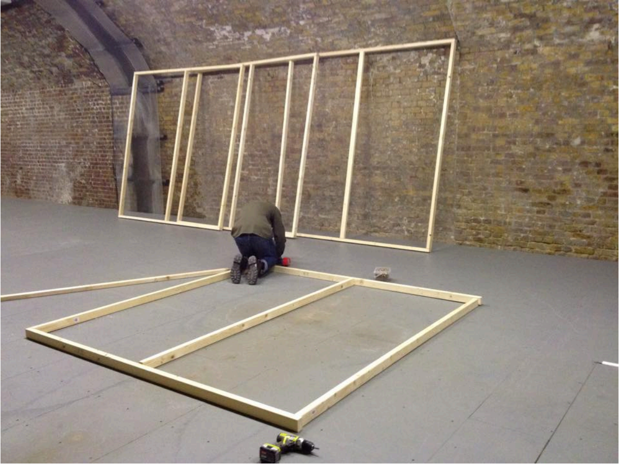
Process image, featuring assistant Chris Fielder building the framework for the structure of KKKK