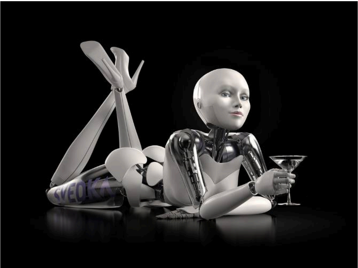
Advertising image for Svedka Vodka (2013)