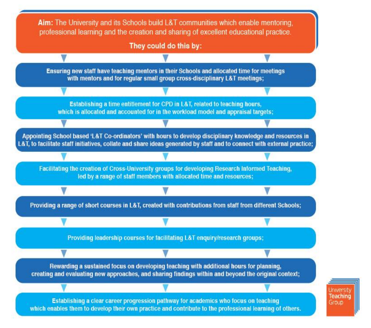
Figure 2. Identified actions to promote professional learning in teaching