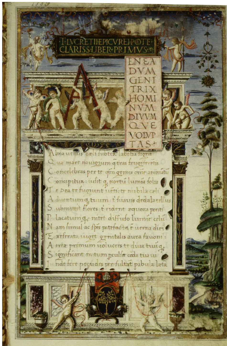
Figure two: Lucretius, De rerum natura , Vat. lat. 1569 fol. 1 recto medbio04 NAN.13