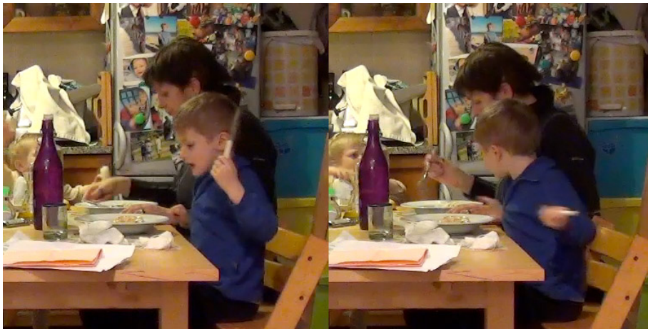
Figure 1: The boy leans forward as he begins his search in Extract 6.

In most of the previous examples it is evident that alongside visual sweeps and zooms, with manual sweeps and with verbal reports of the trouble, Self quite regularly makes adjustments to her/his corporeal department, which is to say to their body position. Generally such body movements bring Self closer to the presumed location or zone of the sought-for object. For instance compare the body position of the boy in the previous example as he begins to say hei 'hey', with his position a little over a second later as he passes his right hand round and under the rim of his dish (Figure 1).