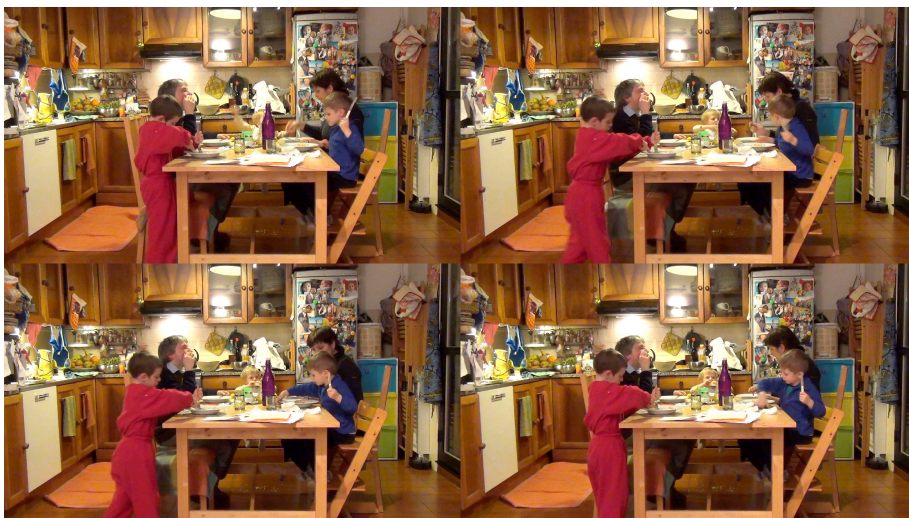
Video 6: The boy (right) sweeps his hand around the rim of his dish visibly searching for his fork. https://youtu.be/F9J1UobumI

In a final example to illustrate how conduct involving arm/hand movement visibly enact searching, an Italian family is sitting down to dinner when the boy on the right, Self, discovers that he does not have a fork with which to eat his food, a difficulty that he announces in no uncertain terms. However, immediately before he verbalises the trouble, the missing fork, he begins a visual sweep moving his head from left to right. As he does so he holds his knife in his right hand, whilst concurrently with the trouble report hei ma io non ce l’ho la forchetta ‘hey but I don’t have the fork’ (line 3), he sweeps his right hand around and just under the rim of his shallow dish, in a tactile search for whether the fork might be hidden under/behind his bowl (line 4). As his hand sweeps around the bowl, his gaze follows his hand movement.