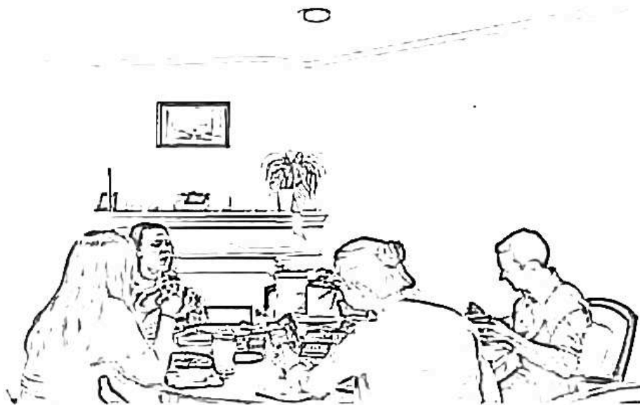
Figure 3: Kelsey (third from left) leans forward and to her left as she searches the table in Extract 3.

And in Extract 3 Self leans forward and to her left as she reaches out to move and look under the packet on table in her search for whatever she's looking for.