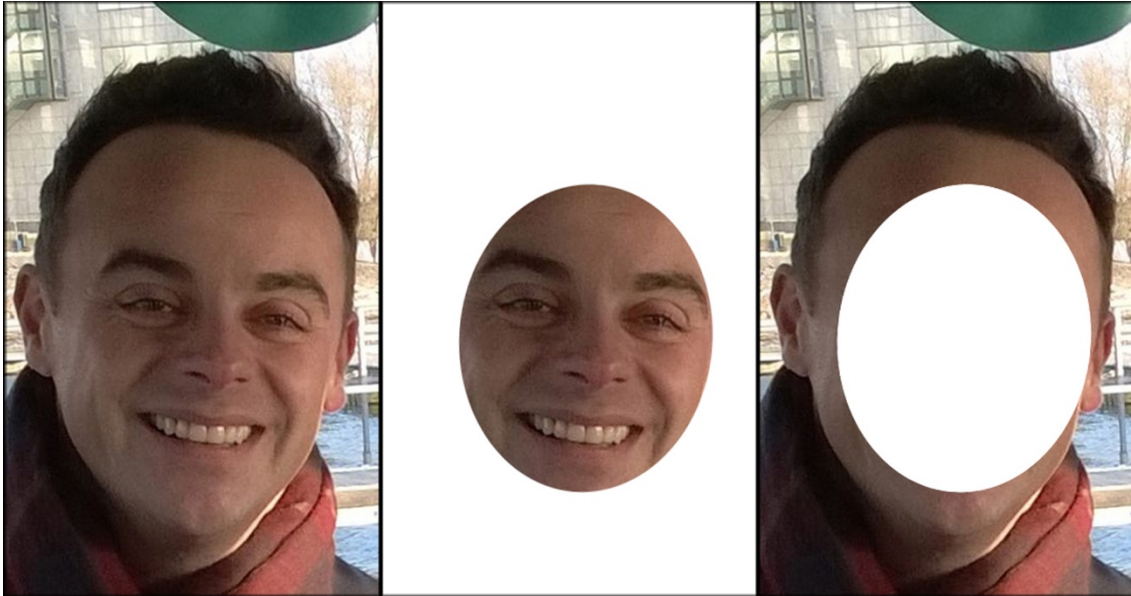
Figure 1. Example image of Anthony McPartlin (used in Experiment 2), showing ‘full’ (left), ‘internal’ (middle), and ‘external’ (right) card types.