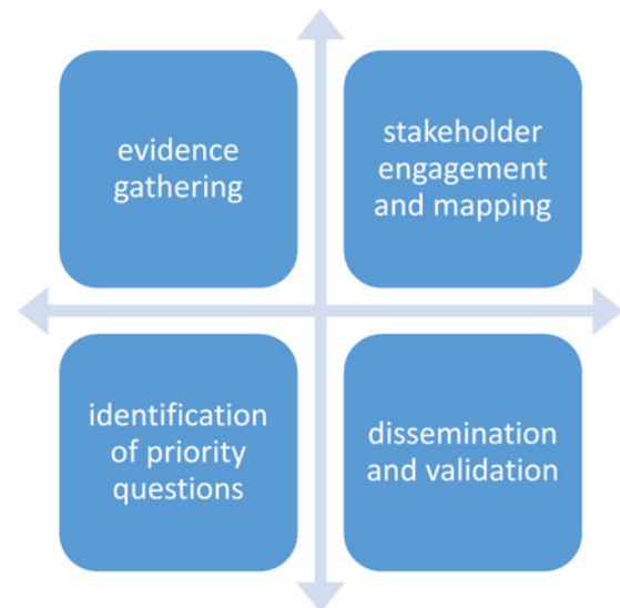
Fig. 3. (Colour online) Case study activities in Benin, Ghana and South Africa.

On various platforms where the experiences of EVIDENT have been shared, there has been a positive response to the achievements made. In addition, EVIDENT has been urged to share the experiences and lessons learnt more widely in order to engender interest and uptake in other settings. A key challenge however remains how to sustain the momentum generated. One of the proposed means is to partner with established initiatives like the Scaling Up Nutrition movement and the Agriculture, Nutrition & Health academy. This way, more stakeholders and also with a varied