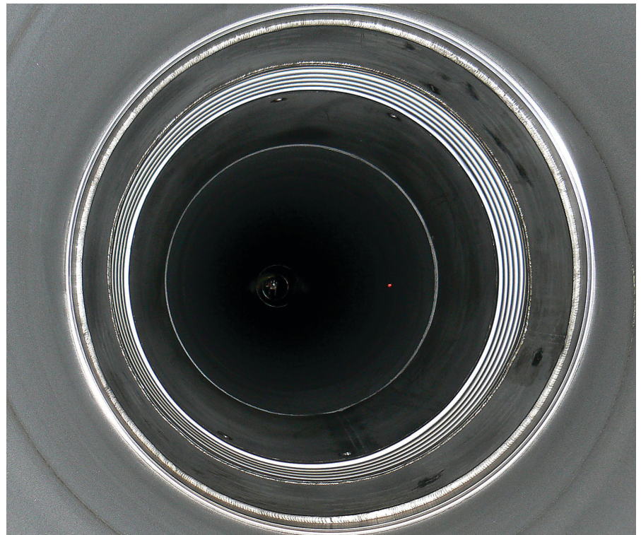
Image of the Laser Interferometer Gravitational-Wave Observatory 40m beam tube.

T ECHNOLOGY CHANGES SCIENCE. In 2016, the scientific community thrilled to news that the LIGO collaboration had detected gravitational waves for the first time. LIGO is the latest in a long line of revolutionary technologies in astronomy, from the ability to ‘see’ the universe from radio waves to gamma rays, or from detecting cosmic rays and neutrinos (the Laser Interferometer Gravitational-Wave Observatory—LIGO—is an NSF-supported collaborative effort by the U.S National Science Foundation and is operated by Caltech and MIT). Each time a new technology is deployed, it can open up a new window on the cosmos, and major new theoretical developments can follow rapidly. These, in turn, can inform future technologies. This interplay of technological and fundamental theoretical advance is replicated across all the natural sciences—which include, we argue, computer science. Some early computing models were developed as abstract models of existing physical computing systems. Most famously, for the Turing Machine these were human ‘computers’ performing calculations. Now, as novel computing devices—from quantum computers to DNA processors, and even vast networks of human ‘social machines’—reach a critical stage of development, they reveal how computing technologies can drive the expansion of theoretical tools and models of computing. With all due respect