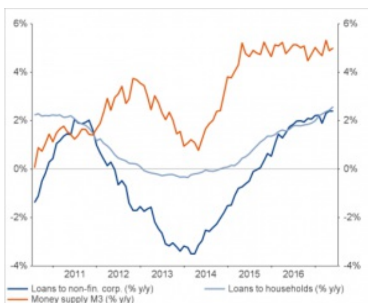
Figure: Retail and corporate lending

It may be advantageous to bypass banks through the use of the CSPP, but it certainly will not be enough going forward. For the programme to be successful, the corporate sector will need to keep channelling the money borrowed to the real economy. This will be true as long as the restructuring and deleveraging of the banking sector continues.