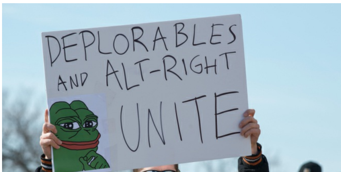
Trump Alt-Right Supporter, St Paul, Minnesota, 4 March 2017