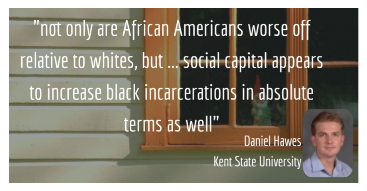
"the tomte: they are everywhere" by Dayna Bateman is licensed under CC BY NC SA

I use state level data from 1986-2009 to examine how social capital affects incarcerations. I find that social capital is associated with slightly lower incarceration rates, which is consistent with the social empathy hypothesis. However, this is only the case for white incarceration rates . For African American incarcerations, social capital is associated with a much higher incarceration rates. This provides support for the social control hypothesis. Looking into this more deeply, I test for a conditional relationship more directly by interacting social capital with the racial composition of each state. This allows me to more explicitly test whether the effect of social capital on the black-white incarceration gap is different for one racial context vs. another. Figure 1 shows that in states with few African American, social capital is actually associated with reducing the black-white disparity in incarceration rates. This suggests that social capital may operate in two different ways. One, it can enhance social trust and empathy for one another, and two, in can enhance social controls and punitiveness for those who break the norm. The evidence here suggests that it does both but that the deciding factor for determining how it will behave is the racial context . In homogenous (white) contexts, social capital increases trust and empathy; however, as diversity and racial threat increases, it operates to enhance social controls resulting in greater racial inequality.