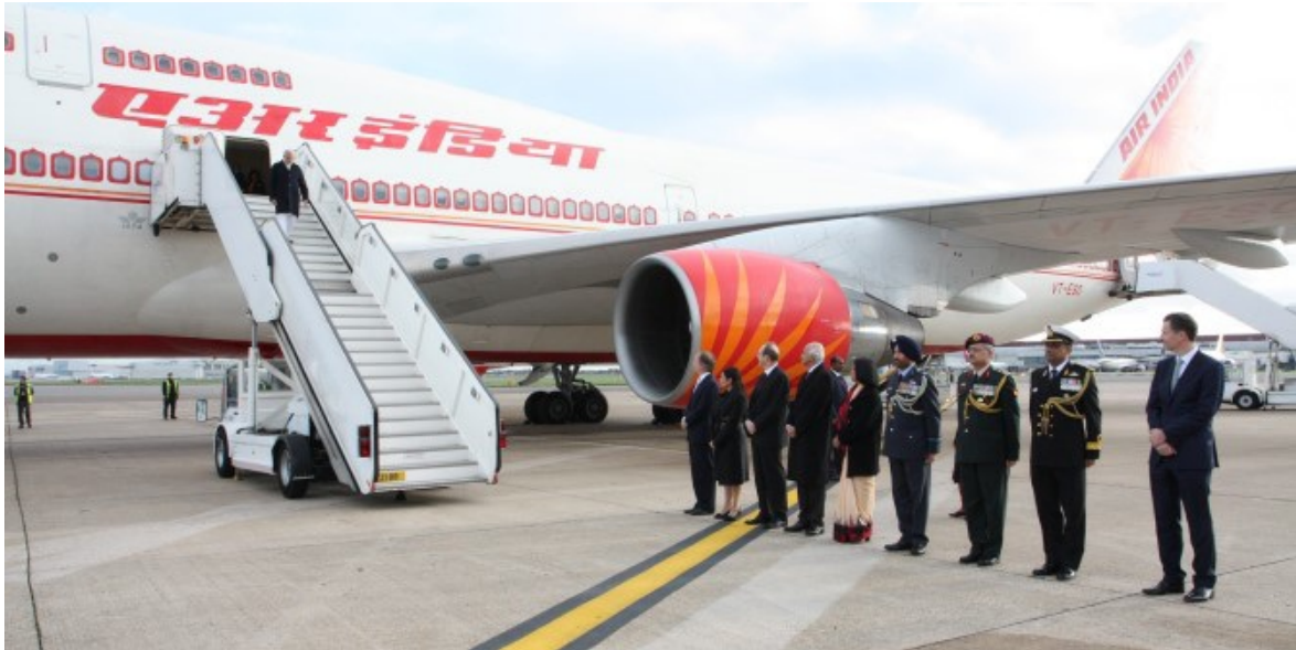
Image: Indian Prime Minister Narendra Modi arrives in London, 12 November 2015.

Raja Mohan avers that India's FP under Modi is to a great extent a continuation of India's foreign policy under Prime Minister Vajpayee (1999-2004) and Manmohan Singh (2004-2014). However, he writes that Modi has also undertaken new initiatives which have led to major changes, due to his cognition. His 'Gujarati pragmatism' has resulted in transactional relations with countries with the intention of making India a great power, or in Modi's own words 'a leading power', thus adding new words in international relations (and political science) lexicon. Modi wants to enhance India's comprehensive national power by increasing India's economic growth rates through economic reform, increasing foreign direct investment and the modernisation of India's armed forces. However, the author also points out that it is difficult to bring about drastic changes in FP of a large country like India due to both internal and external factors discussed above.