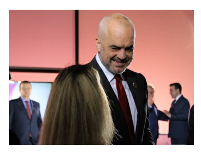
Albania's PM Edi Rama at the Civil Society Forum. In the background: Serbian FM Ivica Dačić and Macedonian PM Zoran Zaev.

The business dimension was prominent, but its concrete outcomes are likewise debatable. The business forum gathered around 1,000 actors in total – representatives from the ministries of economy, but also entrepreneurs, banks and European agencies. The successful signing of a Transport Union was overshadowed by the decision by Bosnia and Herzegovina's entity Republika Srpska not to take part in the accord. The Regional Economic Area – wanted by Serbia but greeted with greater reluctance by several other countries –