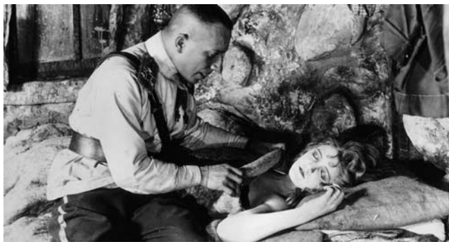
Figure 4 | Beauty in the lap of horror. From Foolish Wives (Erich von Stroheim, 1922). This figure is not covered by the Creative Commons Attribution 4.0 International License. Reproduced with permission of the copyright holder, Kino Lorber, Inc.

“undesirable” immigrants, and with WWI still a recent trauma, the Austrian Von Steuben and the Russian Karamzin are merged with the “man you love to hate” image of Erich von Stroheim (an Austrian Jew by birth), as symbols of menacing, alien masculinity (Fig. 3). Staiger astutely observes that while another screen foreigner, Rudolph Valentino, was also feared as a non-normative seducer of American women, he remained “a desired Mediterranean”; the unpleasantly deviant Stroheim, a Germanic European, functioned as an “ undesired Anglo-Saxon” (Staiger’s emphasis), just when President Roosevelt was warning of an Anglo-Saxon “race suicide” (Staiger, 137). Even more specifically, Fischer argues that as anti-German feelings were especially high, notions of the “Evil Hun”, and their strong association with rape, are readily invoked by Stroheim’s characters (Fischer, 525). Stroheim’s own cinematic past only reinforced these notions, as his role in The Hearts of Humanity (Allen Holubar, 1918) had seen him as a German soldier who prepares to rape a woman by throwing her baby out of a window.