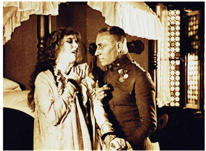
Figure 1 | Margaret is thrilled yet terrified. From Blind Husbands (Erich von Stroheim, 1919). This figure is not covered by the Creative Commons Attribution 4.0 International License.