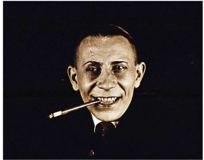
Figure 3 | Wicked: the man they loved to hate. From Blind Husbands (Erich von Stroheim, 1919). This figure is not covered by the Creative Commons Attribution 4.0 International License.

The next morning the weather has cleared, allowing everyone to go home; while Mrs Hughes finds her husband unconcerned by her escapade, Karamzin is involved in a scene with Maruschka, who is distressed and tearful. It transpires that the Count had previously seduced the maid and promised to marry her; he now attempts to reassure her and gives her a kiss, wiping his mouth afterwards. He then goes to Ventucci's house, where young Marietta lies ill and bedridden, sleeping in a darkened room. While her father is preparing the fake money, Karamzin furtively approaches the girl, again smacking his lips; he exudes a menacing lust. But just as he bends over the sleeper, he hears Ventucci returning, and rapidly moves away. Back at the Villa Amorosa, more passionate drama from Maruschka awaits him: this time the Count invents a sad story about his financial troubles, and persuades the infatuated woman to give him all her life savings. The action moves again to Monte Carlo society, and Karamzin watches Mrs Hughes win a huge sum at the roulette. She declines Princess Olga's invitation to join them at home for more gambling, but then receives a note from the Count, begging for a secret meeting at the Villa. Unable to resist, Mrs Hughes goes to Karamzin and is seen by Maruschka, who is driven insane