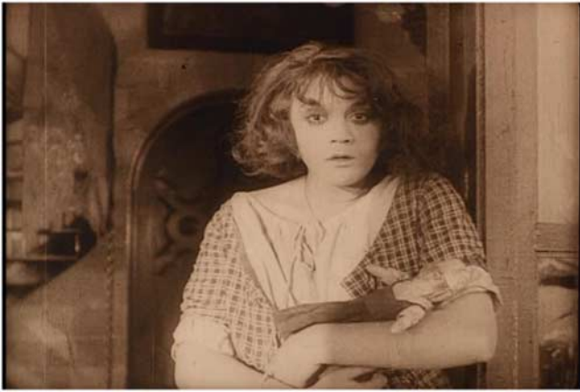
Figure 2 | Marietta looks child-like and vulnerable. From Foolish Wives (Erich von Stroheim, 1922). This figure is not covered by the Creative Commons Attribution 4.0 International License.