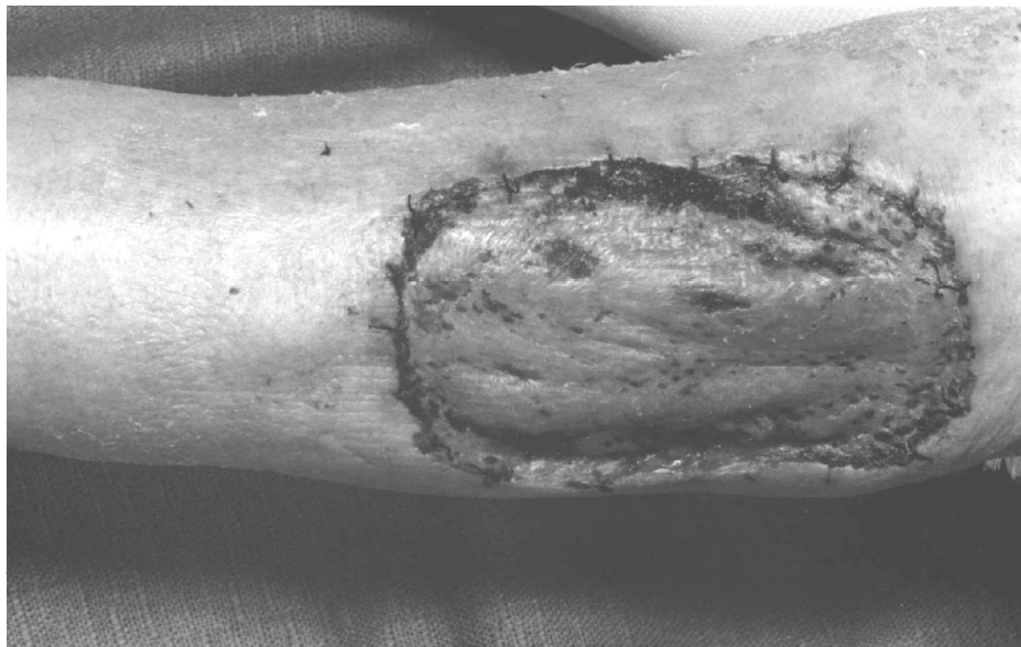
Figure 3. Photograph of the leg in Fig. 2 following wide excision of a 10×10 cm, grade 3 leiomyosarcoma and repair of the defect.

favourably with results using conventional radiotherapy. 1,2,30 This suggests that hyperfractionated radiotherapy using twice daily 1.2 Gy fractions is well tolerated with good local control rates and no increase in the incidence of late toxicity.