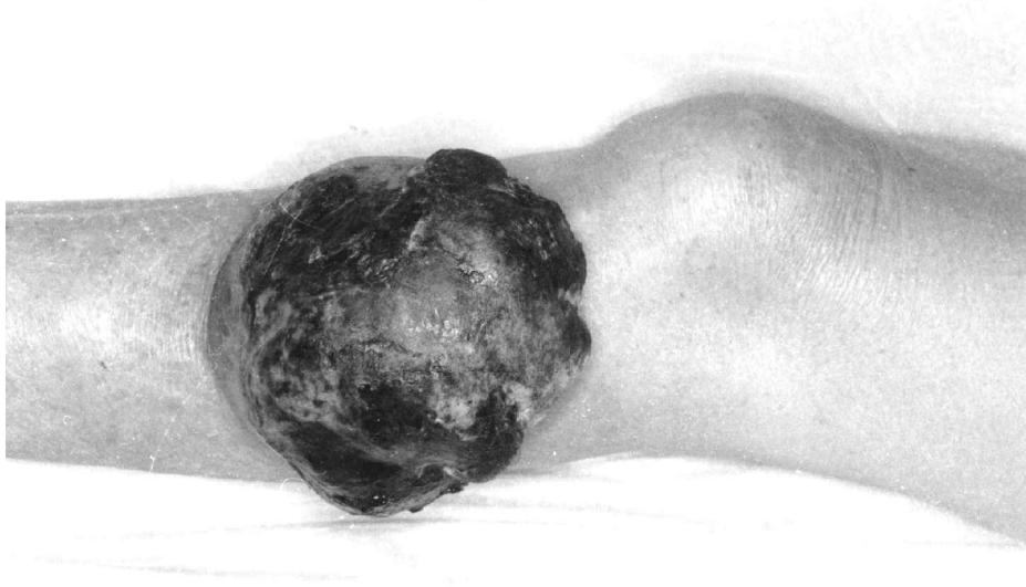
Figure 2. Photograph of an ulcerated soft tissue sarcoma in the upper outer aspect of the lower leg in an 88-year-old woman.