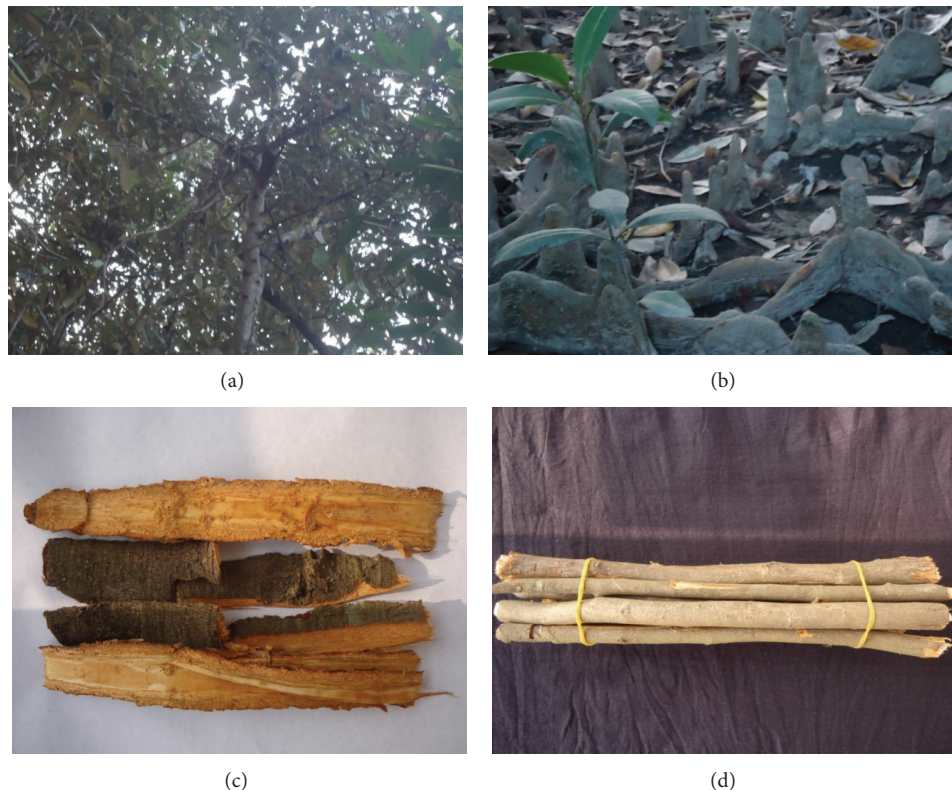
FIGURE 1: Various parts of Heritiera fomes . Clockwise from top left: tree, pneumatophores, twigs, and barks.

screen compounds. Substances in mangroves have long been used in folk medicines to treat diseases [4]. Extracts of various parts of mangrove plants have significant activity against animal, human, and plant viruses including human immunodeficiency virus [5].