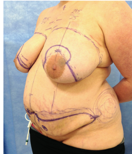
FIGURE 1: Preoperative photograph of a 33-year-old female (Patient 2) showing skin bruising on the left lower abdomen prior to bilateral mastectomy and DIEP flap reconstruction.

2.3. Patient 3. A 37-year-old female with a grade II invasive ductal carcinoma developed a left subclavian port-related thrombosis one month after the start of 6 cycles of primary chemotherapy and was started on a course of therapeutic