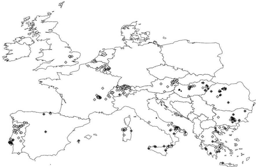
Fig. 1. The geographical distribution of cats in this study which were infected by lungworms. Grey-shaded squares represent locations where cats were free of infection, and black squares represent locations where infected individuals were detected. Where cats were collected from the same location, some markers overlie each other.