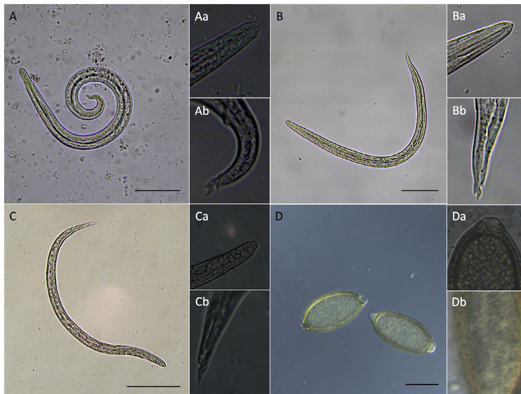
Fig. 3. Feline lungworm infections diagnosed during this study (scale bars = 100 \mu\text{m} ). L1s of Aelurostrongylus abstrusus (A), Troglstrongylus brevior (B), and Oslerus rostratus (C), with magnifications of the anterior (Aa, Ba, Ca) and posterior extremities (Ab, Bb, Cb). Eggs of Eucoleus aerophilus (D), with particulars of the polar plug (Da) and of the net-like surface of the egg (Db).