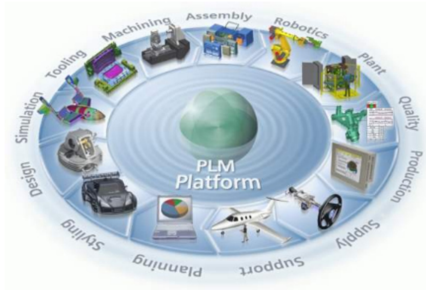
Figure 1. Siemens Teamcenter PLM platform [13]