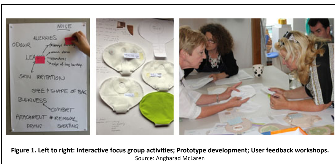
Figure 1. Left to right: Interactive focus group activities; Prototype development; User feedback workshops.