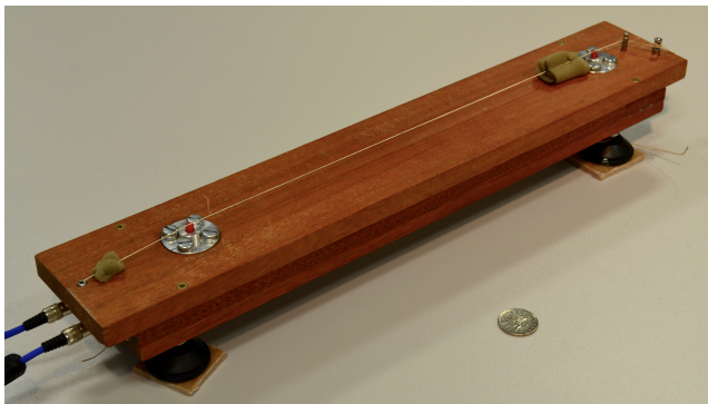
Figure 3: The string-board controller. The string is stretched over two bridge pistons, each of which rests on an internally mounted piezoelectric disk that sense the vibrations. Foam pieces are employed to suppress round-trip waves along the string.

native mode of interaction affords slightly different nuances in the generated excitation signals.