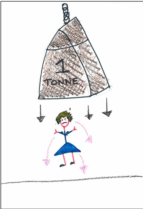
Time 1: Two months before the PMP