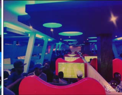
Figure 12: Gaming parlour, Nairobi CBD (2016)