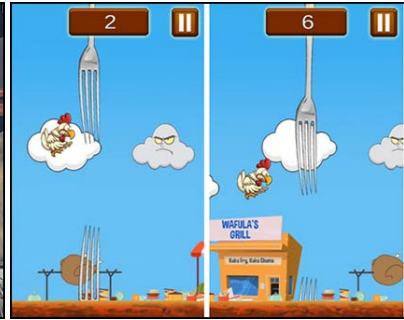
Figure 9: Kuku Sama (2015), by Black Division Games, screenshot of gameplay