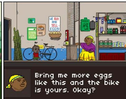
Figure 6: Kade (2015), by Urban Design Kings, screenshot of gameplay