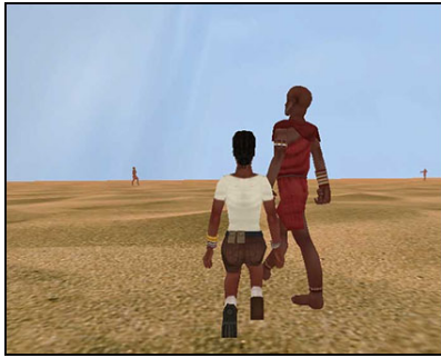
Figure 1: Adventures of Nyangi (2012), by Wesley Kirinya, screenshot of gameplay