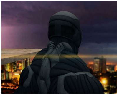
Figure 7: Nairobi X (2014), by Andrew Kaggia , screenshot of gameplay

5 on a mobile phone. ‘You take the role of a distressed chicken trying to escape from Wafula, who wants to make you into his dinner. This game is extremely addictive and people from all walks of life love it. You can subscribe to it on Safaricom and MTN portals and it is basically available all over Africa,’ explains Kaggia (Kaggia, 2016).