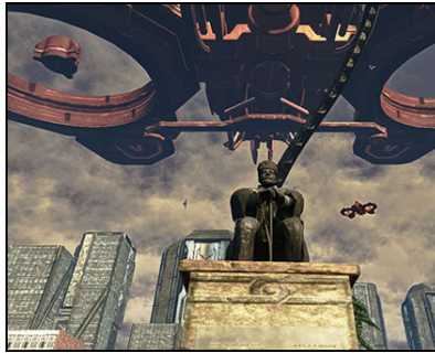
Figure 8: Nairobi X (2014), by Andrew Kaggia , screenshot of gameplay