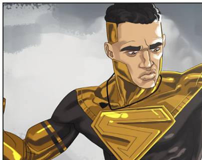
Figure 4: African Superman (2016), by Salim Busuru, as seen at salim_busuru.artstation.com

Urban Design Kings and other Kenyan developers are tapping into a fast-growing mobile market within Kenya where, according to the Communications Authority of Kenya, the number of mobile subscriptions in September 2015 was almost 38 million, up from almost 33 million in September 2014. However, according to Evans, while games that can be described as ‘local’ in terms of their characters and settings are aimed at a developing Kenyan market, that market is not yet adequately developed and most of the projects generated by Urban Design Kings do not offer enough income to allow the studio to operate at a profit. With the explicit aim of developing a local gaming community, growing the Kenyan games industry around narratives from within Kenyan culture, the trio have launched the online platform ChekiChezo ( http://www.chekichezo.com/ ) - a website for Kenyan developers to meet virtually, and upload and share their portfolios.