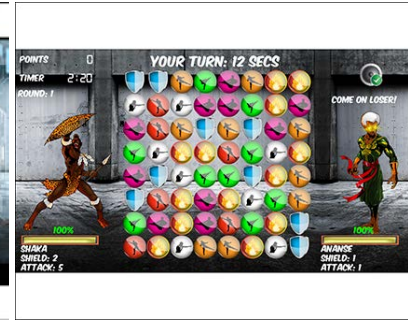
Figure 3: Africa's Legends (2014), by Leti Arts, screenshot of gameplay