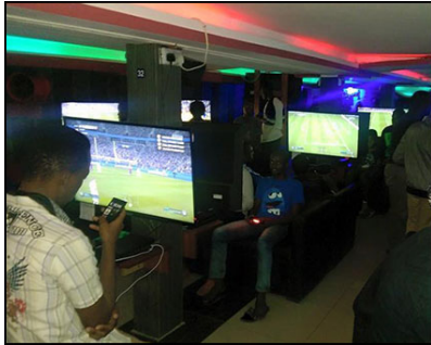
Figure 10: Gaming parlour, Nairobi CBD (2016), commissioned photography

spaces and mentoring. And there are others, too, with more springing up every year (Ross, 2013).