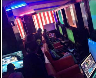
Figure 10: Gaming parlour, Nairobi CBD (2016), commissioned photography