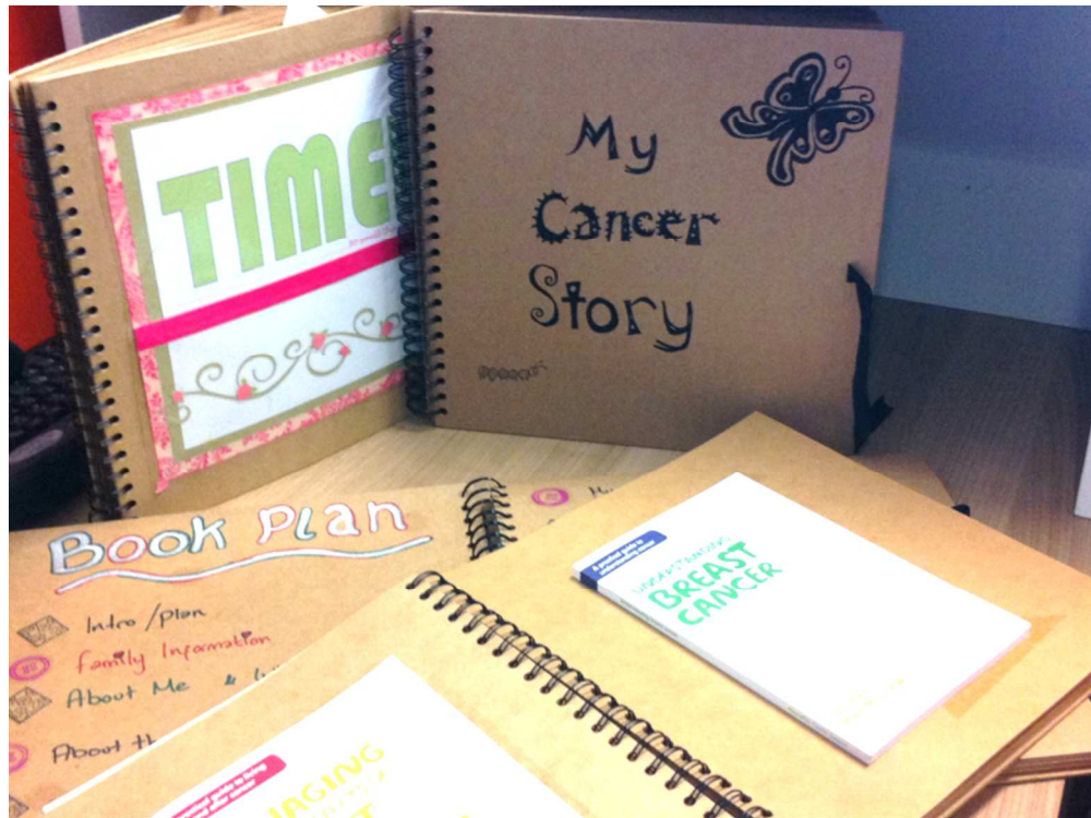
Figure 1. Books of experience