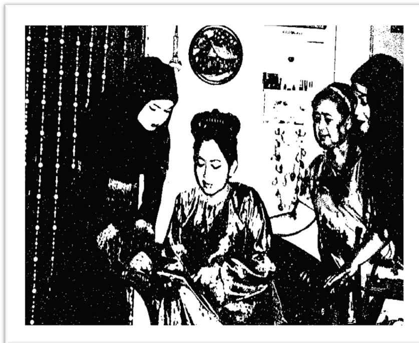
Fig. 3. Friends and family gathered at home to prepare Malay festival, Hari Raya Puasa. (photovoice filtered image)

This fear of gossip and conflict increased their wariness to expand their social network and join community activities. Similarly, participants relayed how gossip in community activities led some older adults to discontinue these activities. These older adults valued the intimacy of social interactions with familiar people which they perceived brought about safer and more meaningful interactions, compared to community activities which could seem more focused on external program elements, such as quantity of turnout.