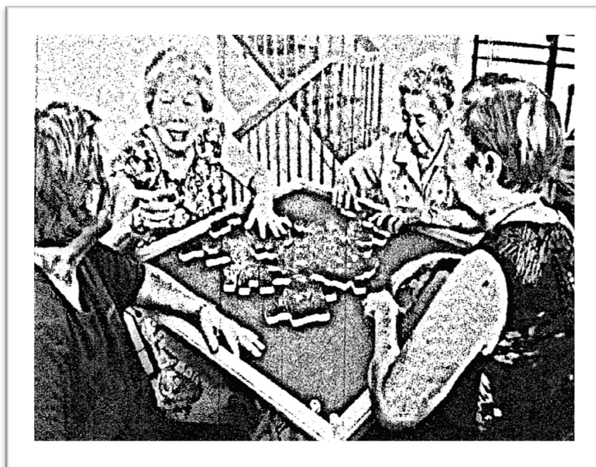
Fig. 2. 'Love for mah-jong': older Chinese women gathering to play. (photovoice filtered image)

For other older adults, focusing on social interaction with familiar people and activities was a way to regulate and simplify their social life. They perceived benefits in doing so, to reduce the complexity that came with interacting with new people in new social situations. Not getting along with someone, or meeting someone who could not be trusted, were perceived as potentially troublesome events that should be avoided. For example, in the CFGD, one participant explained how they preferred to avoid community activities and stick to inner social circles 'in case they offend some people. Gossiping. Sometimes you may not say anything but others accuse that you say certain things.' (CFGD3)